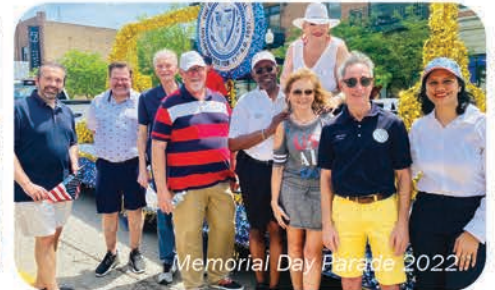
Memorial Day Parade 2022!!!