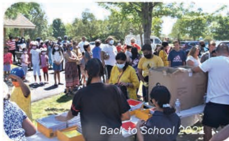
Back to School 2021

EXCHANGE CT, PENNSBURY LN, GREGORY ST, SHEFFER RD