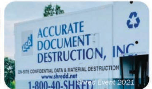
Shred Event 2021