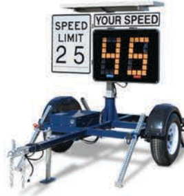
WARD 10 SPEED TRAILER

To speak at a COW or Council meeting, please notify the City Clerk's office at 630-256-3070 prior to the start of the meeting.