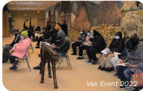
Vax Event 2022