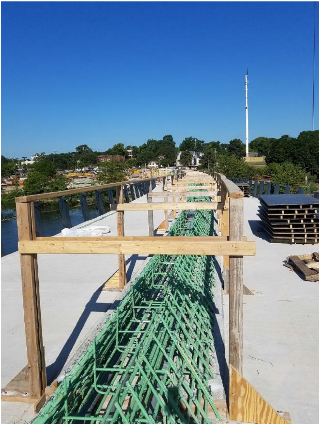
August 7, 2020. Forming cornice. Spans 1-3