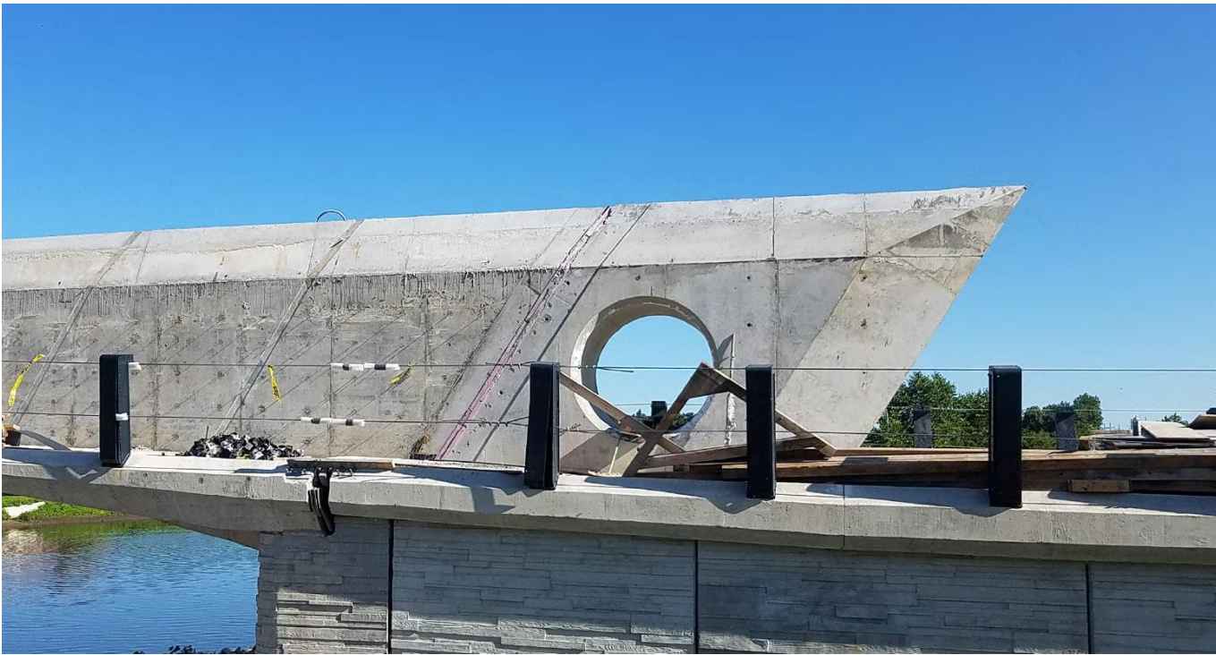
August 4, 2020. East monument. Looking north