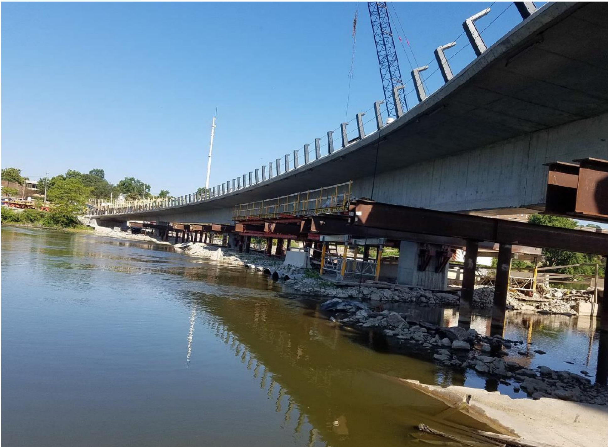
August 7, 2020. Looking west, contractor removing deck supports.