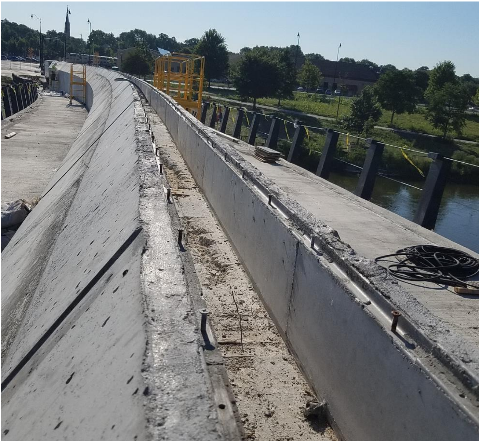
August 14, 2020. Top of bridge cornice. Concrete channel for cornice lighting