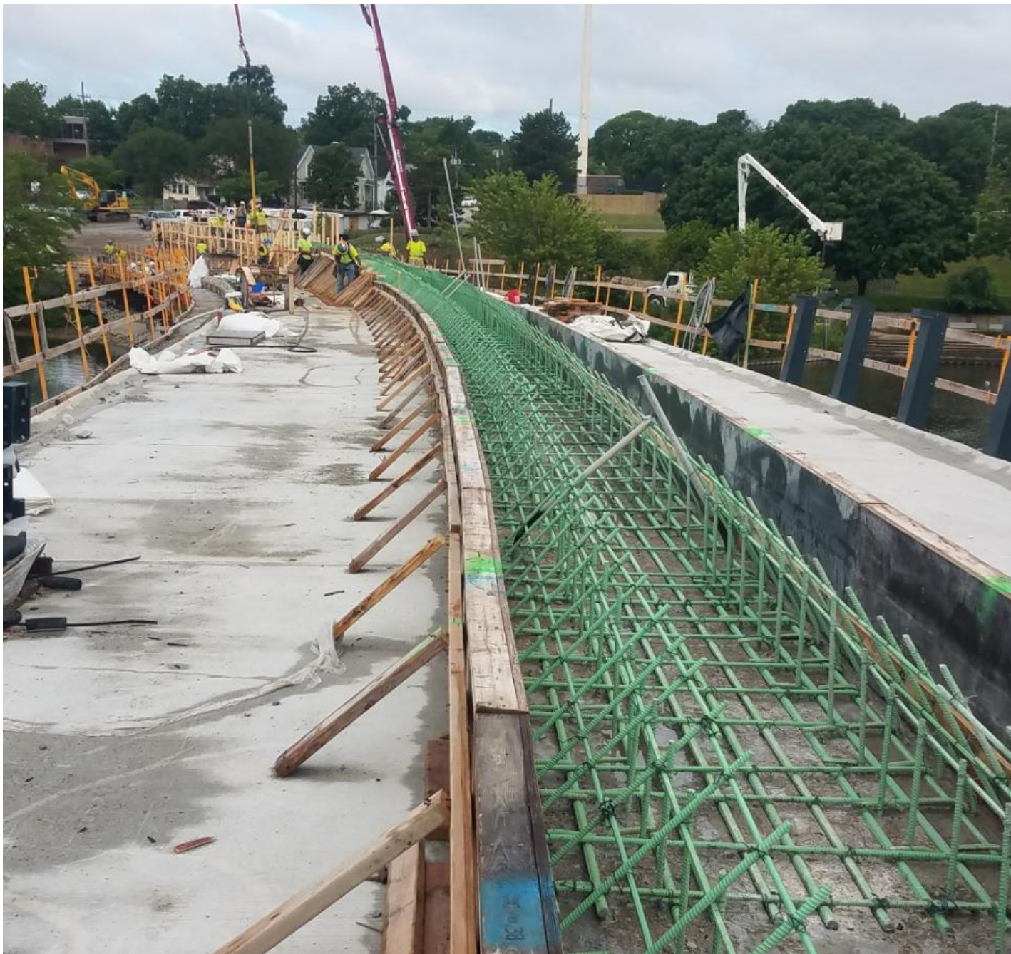
August 10, 2020- Pouring of upper box, span 1 and 3. Looking west