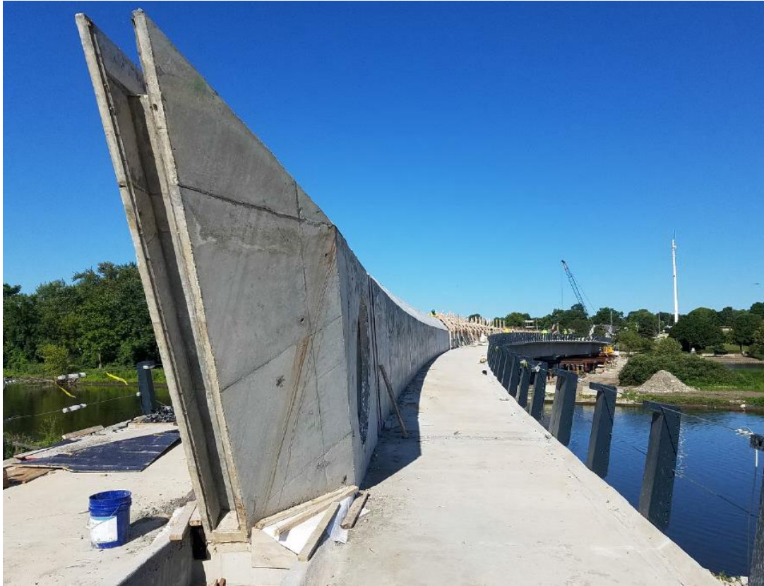
August 4, 2020. East monument. Looking west.