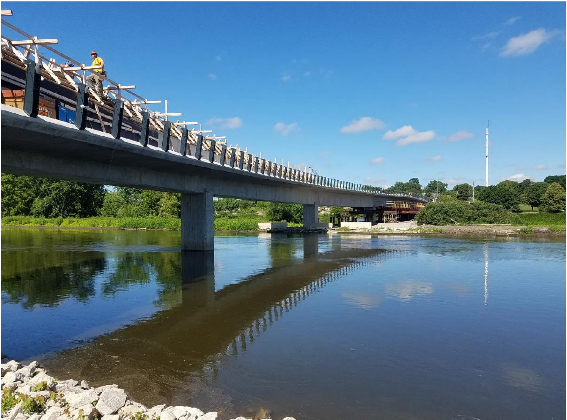
July 23, 2020. Forming cornice, span 6 and 7. Looking west.