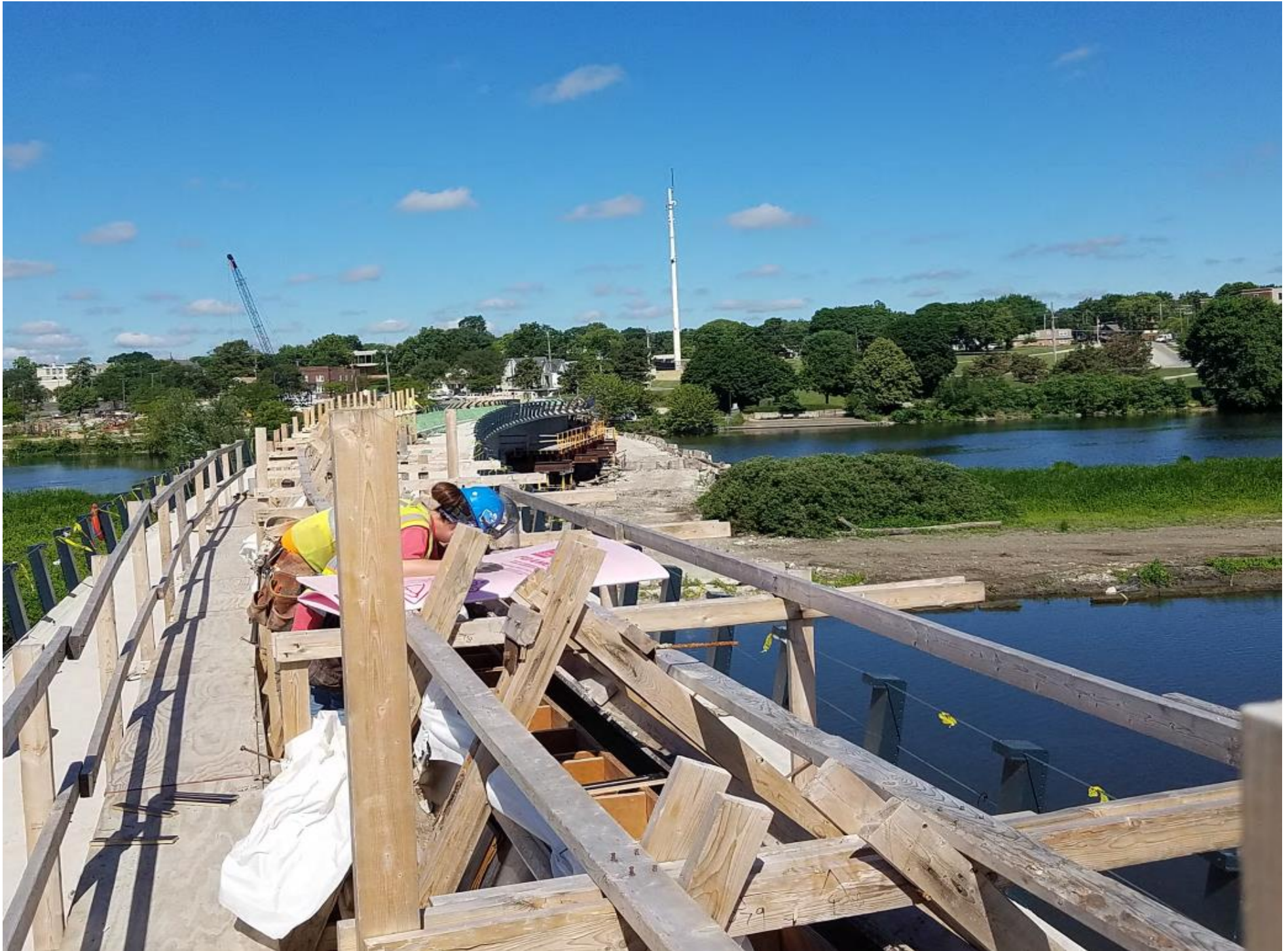
July 23, 2020- Contractor forming cornice.