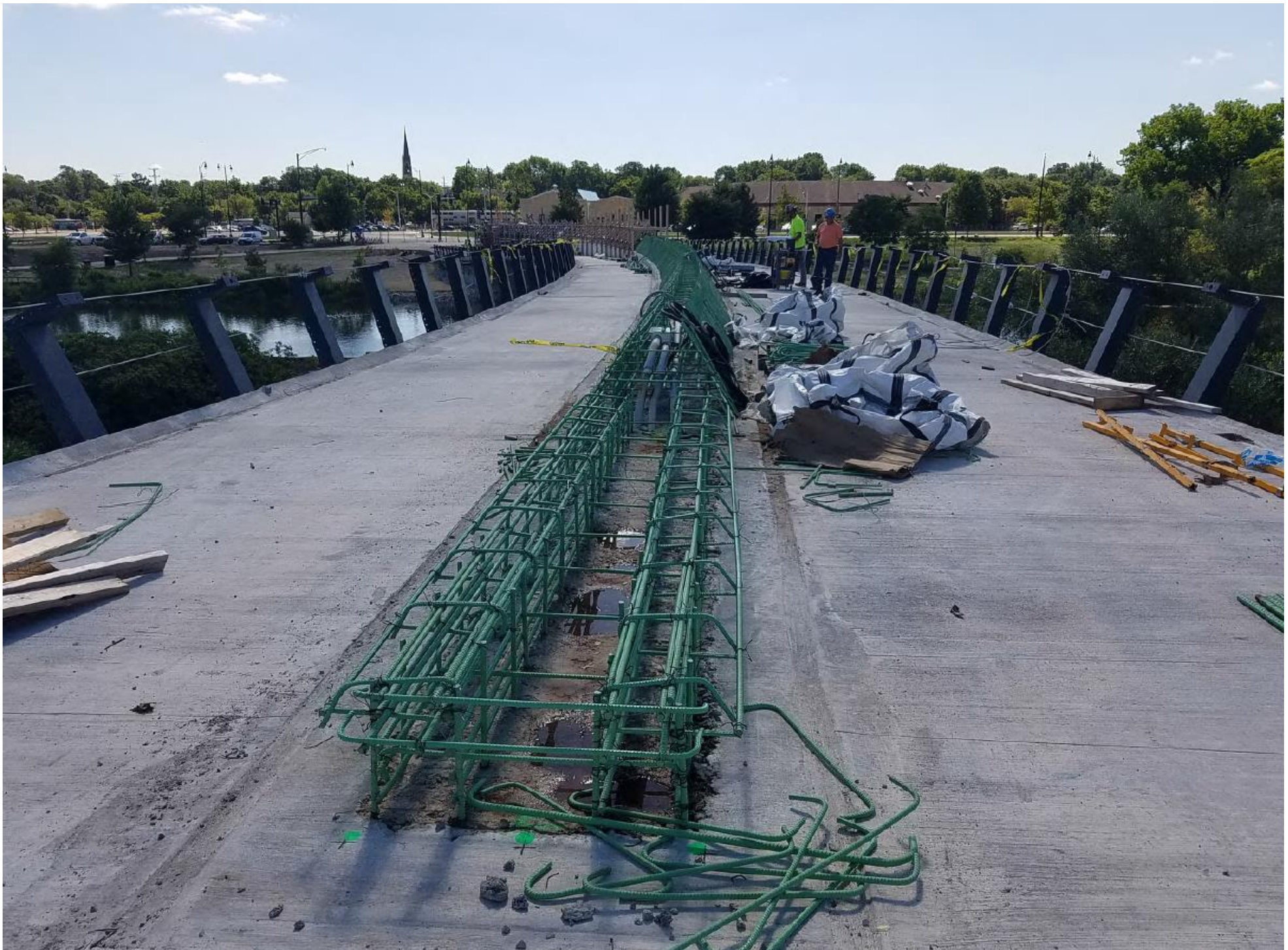
July 23, 2020. Installing reinforcements, looking east. Span 5 and 6.