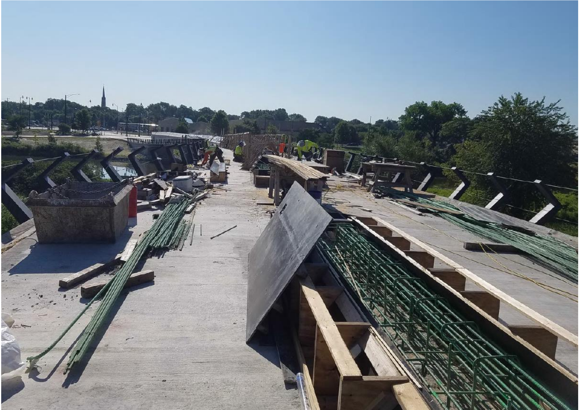
August 7, 2020. Forming cornice. Spans 4 and 5