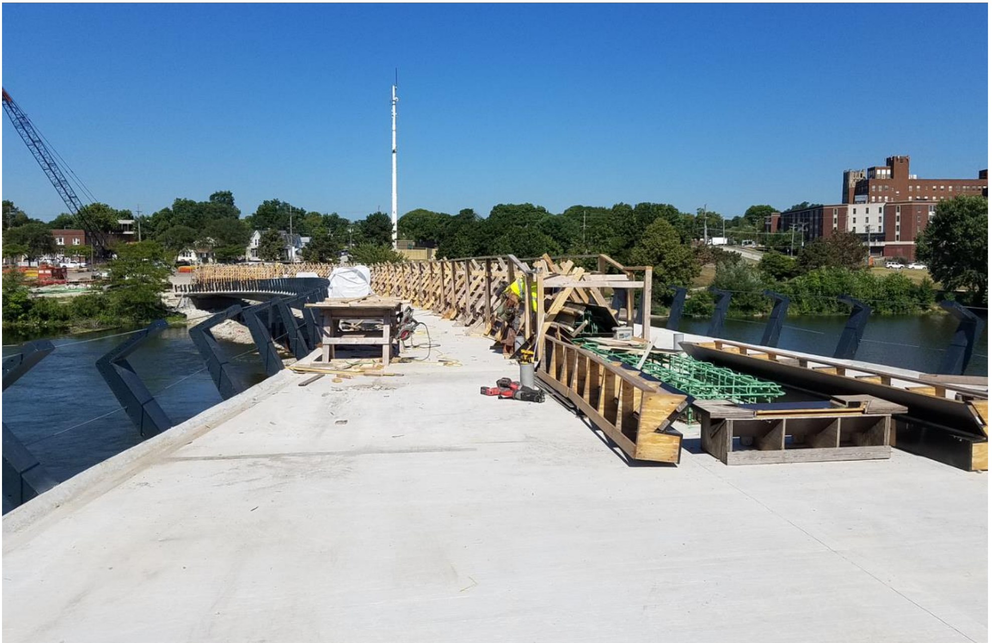
August 14, 2020. Bridge deck, looking west. Contractors forming cornice for concrete pour.