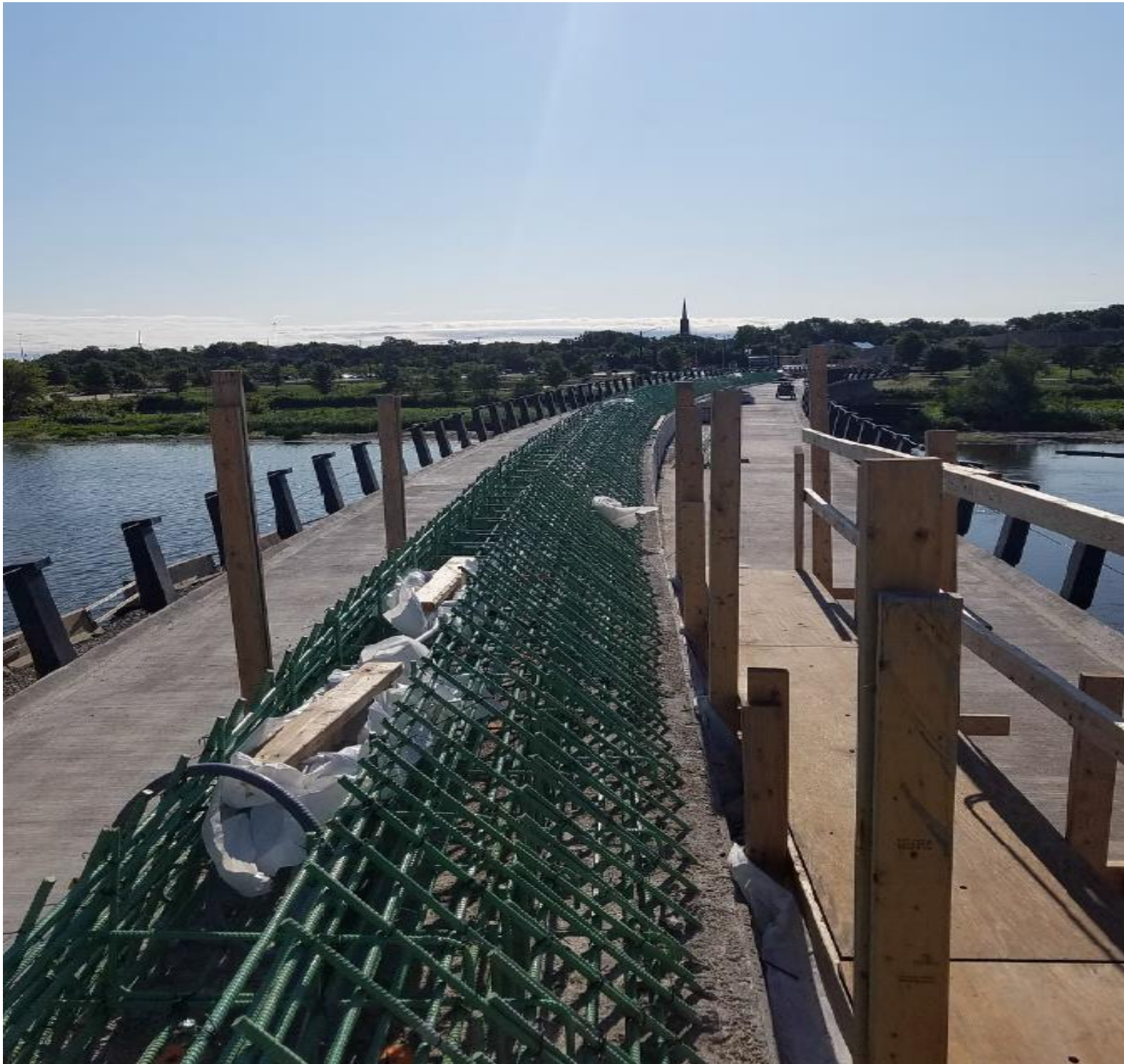
August 4, 2020. Bridge Condition. Looking east, cornice section