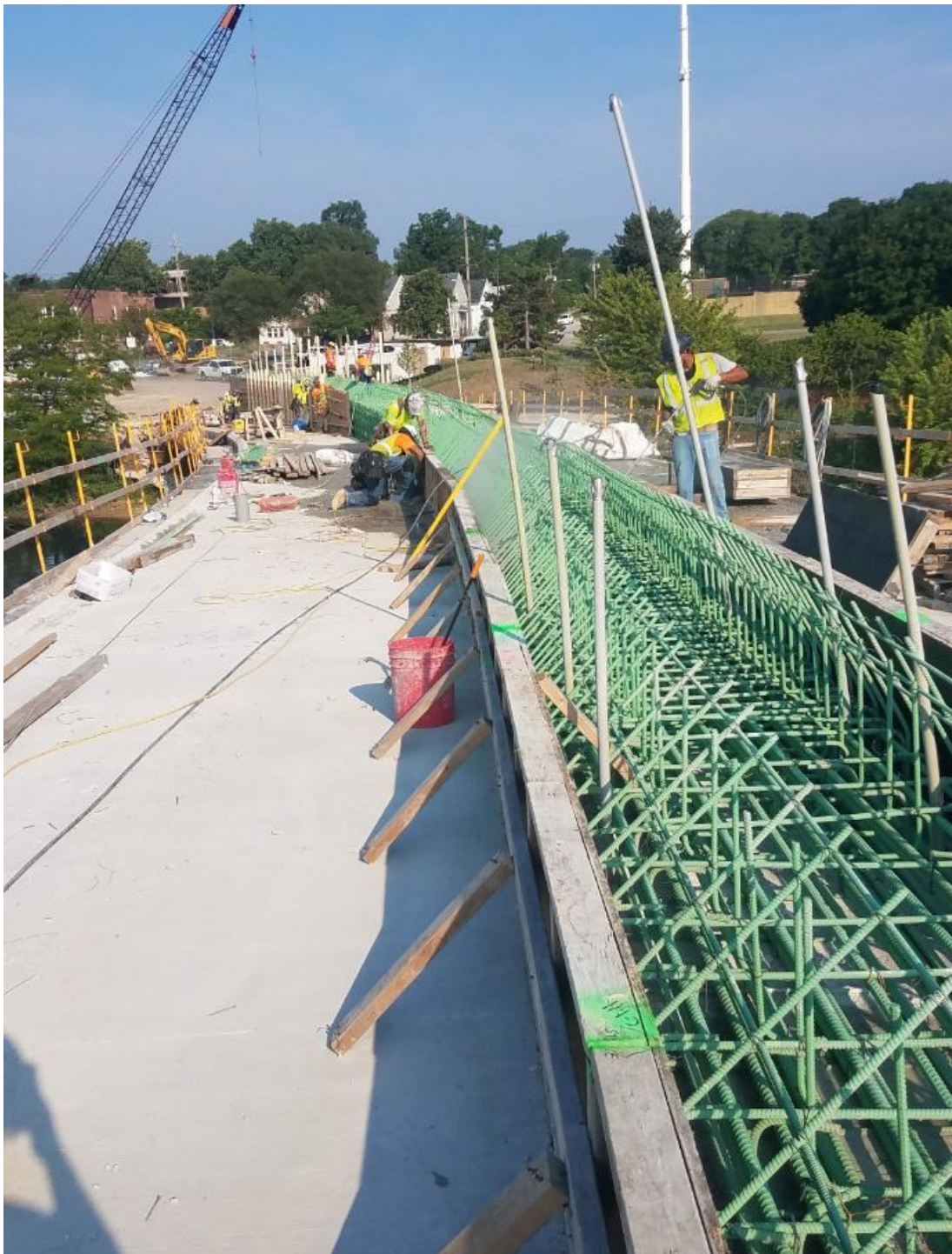
August 8, 2020. Forming upper box and cleaning reinforcements.