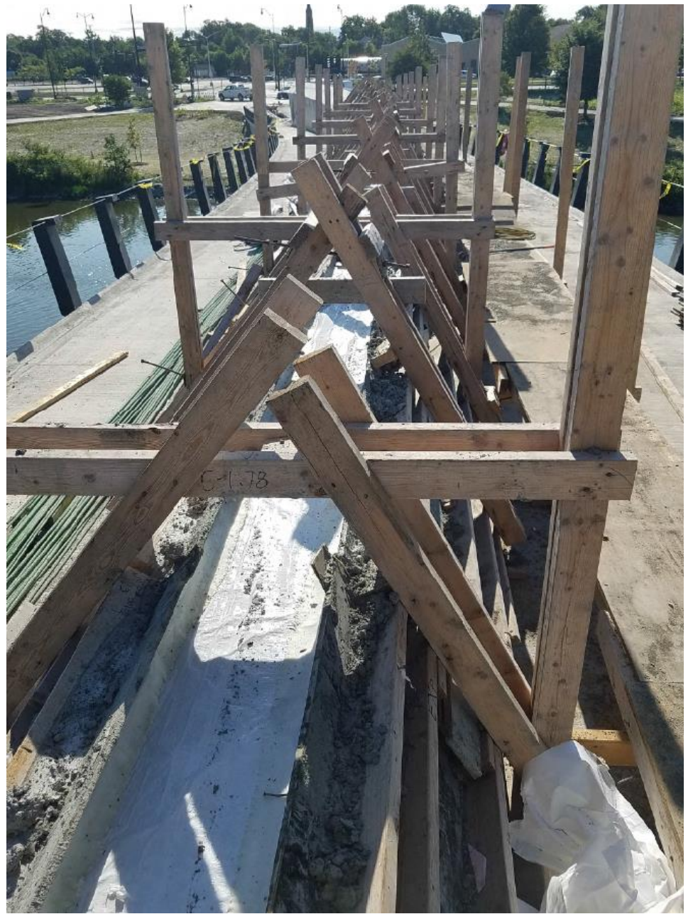
August 4, 2020. Top section of cornice, pour concrete channel for cornice lighting. Looking east.