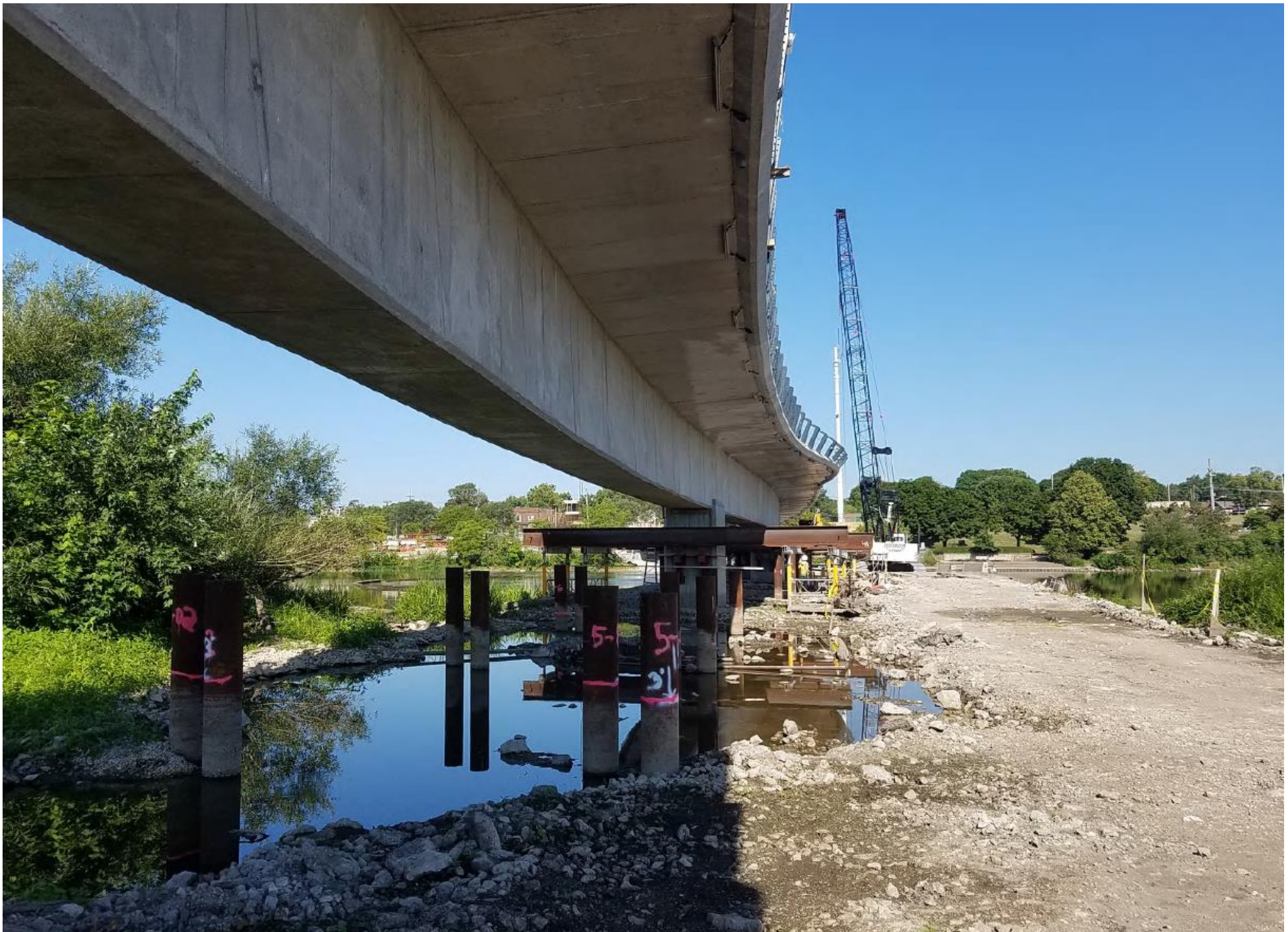
August 7, 2020. Looking west, contractor removing deck supports.