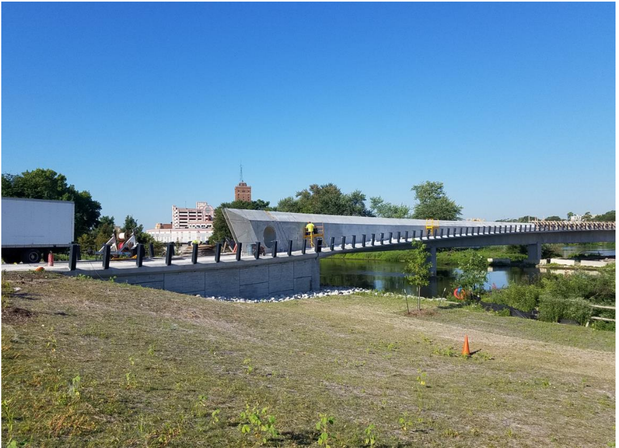
August 14, 2020. Current bridge condition. Looking west.