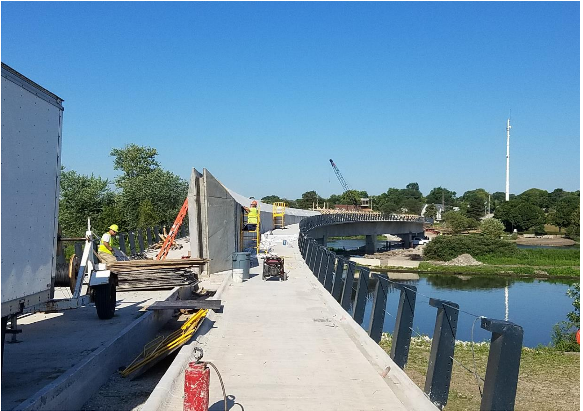
August 14, 2020. Patching and grinding bridge, looking west