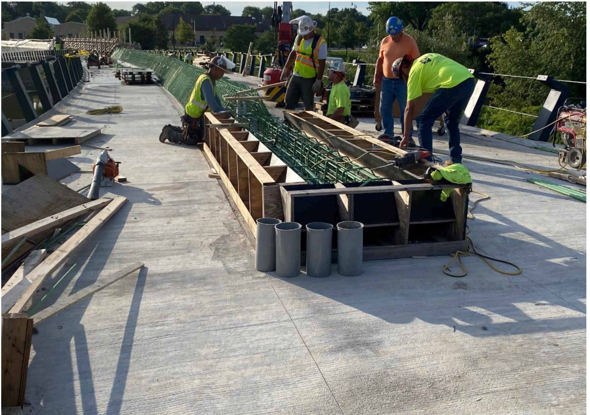
July 31, 2020. Forming and installing reinforcement-bridge bench. Looking east.