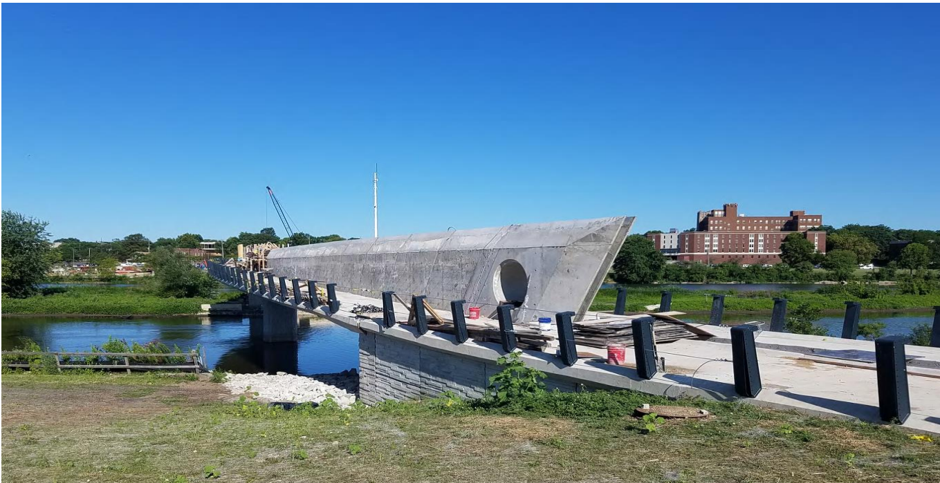
August 4, 2020. East monument. Looking NW