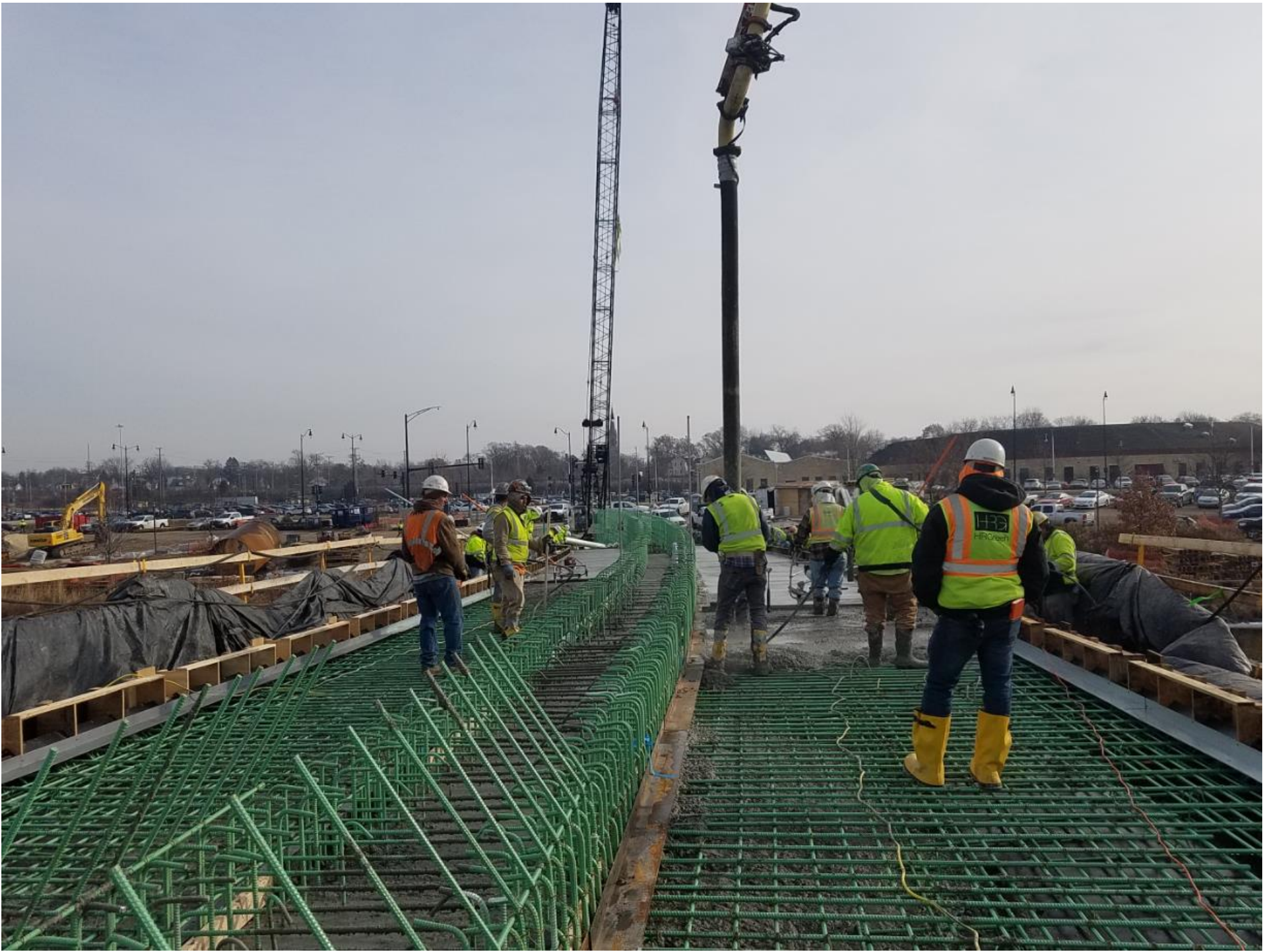
12/20/2019. Pouring bridge deck at spans 5 and 6.