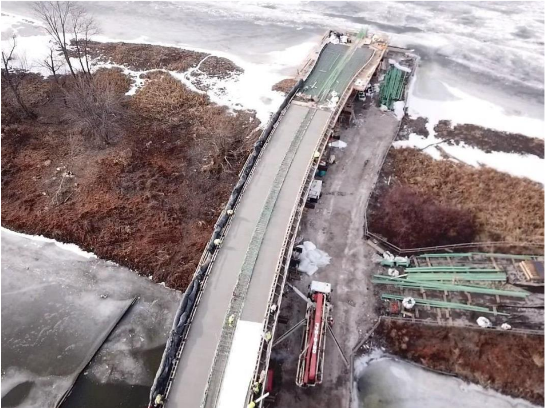
12/23/2019. Aerial view of poured concrete deck at spans 5 and 6. Looking west