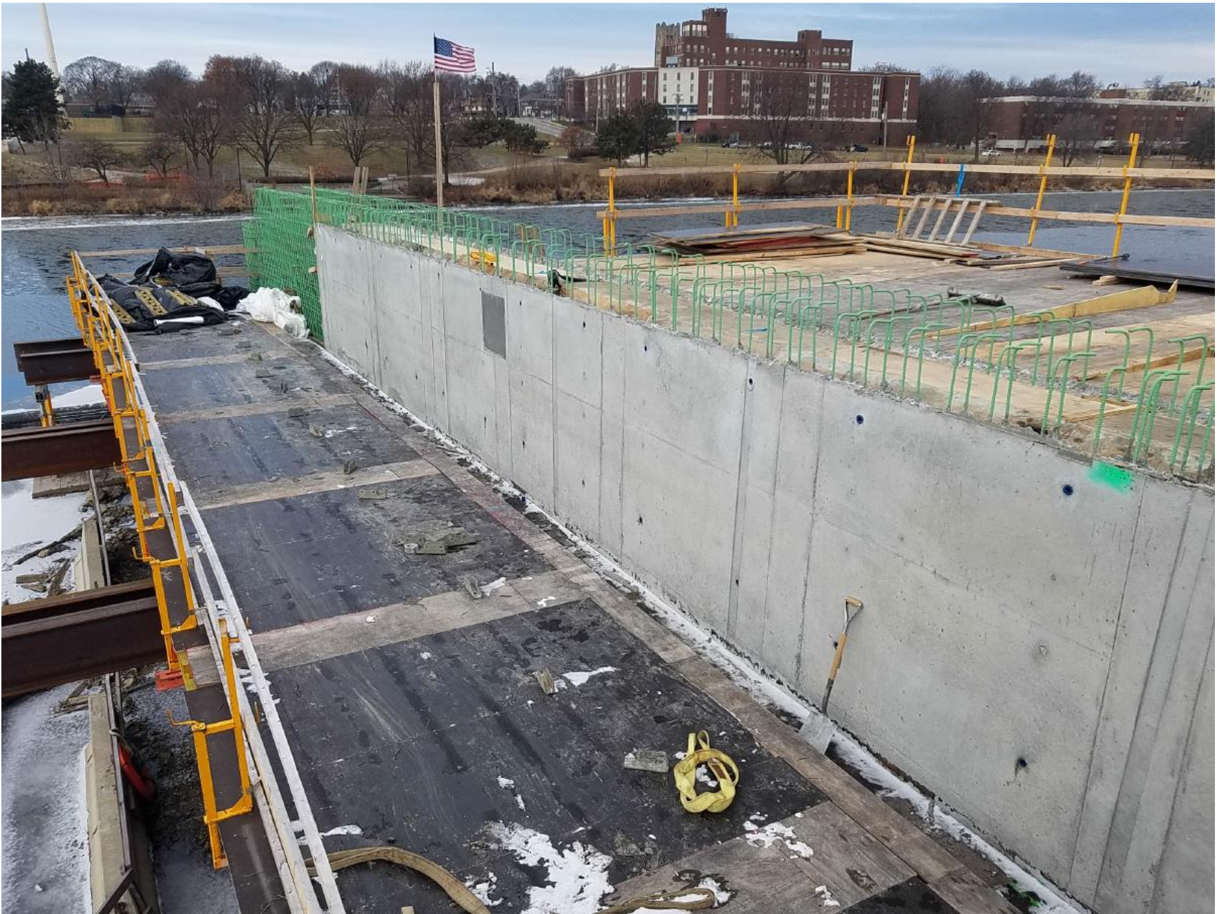
12/12/2019-lower box section at span 4. Looking west.