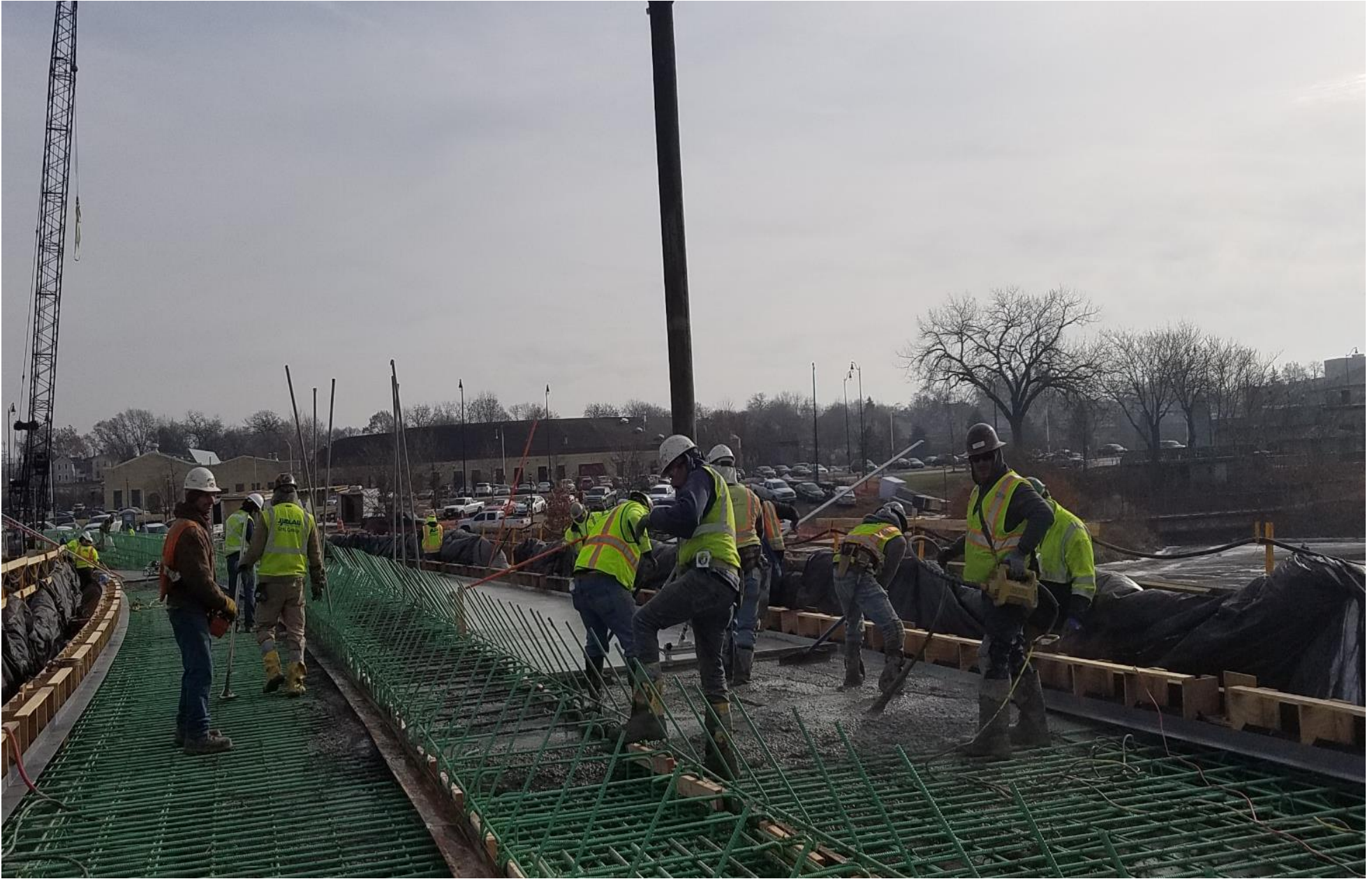
12/20/2019. Pouring bridge deck at spans 5 and 6.