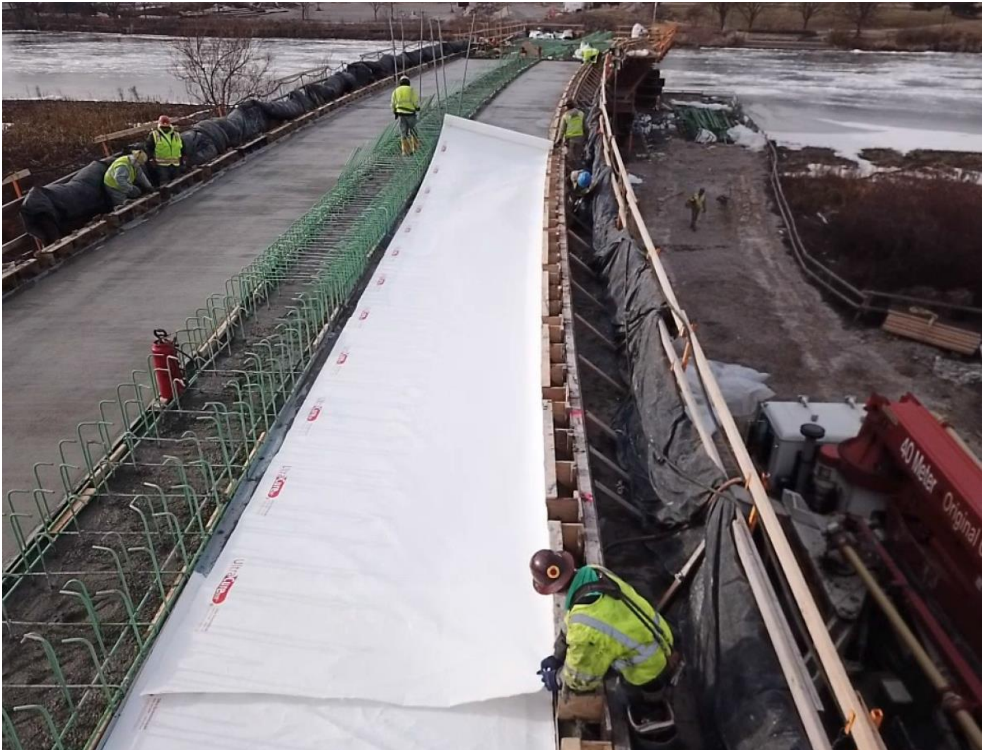
12/23/2019. Contractor providing winter protection, covering up concrete deck at spans 5 and 6.