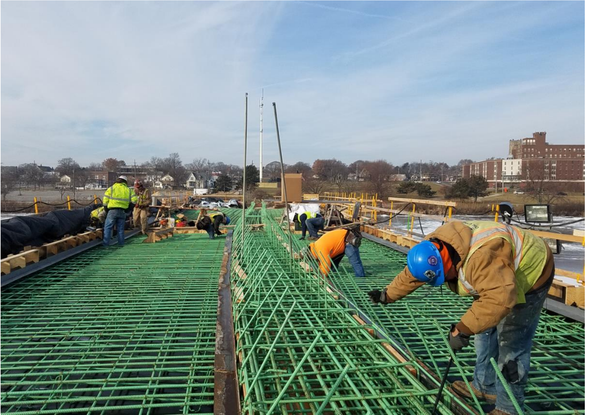
12/20/2019. Installing deck reinforcement at span 4