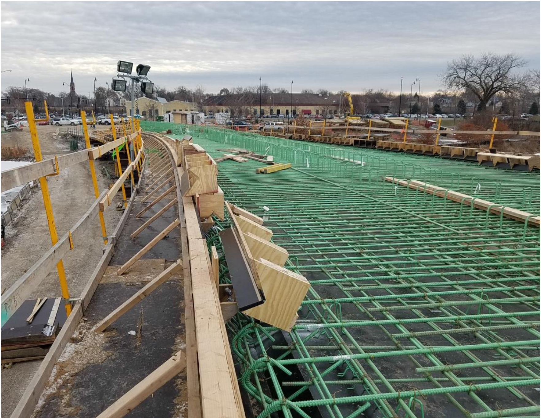
12/12/2019- installed reinforcement at spans 5 and 6. Looking east.