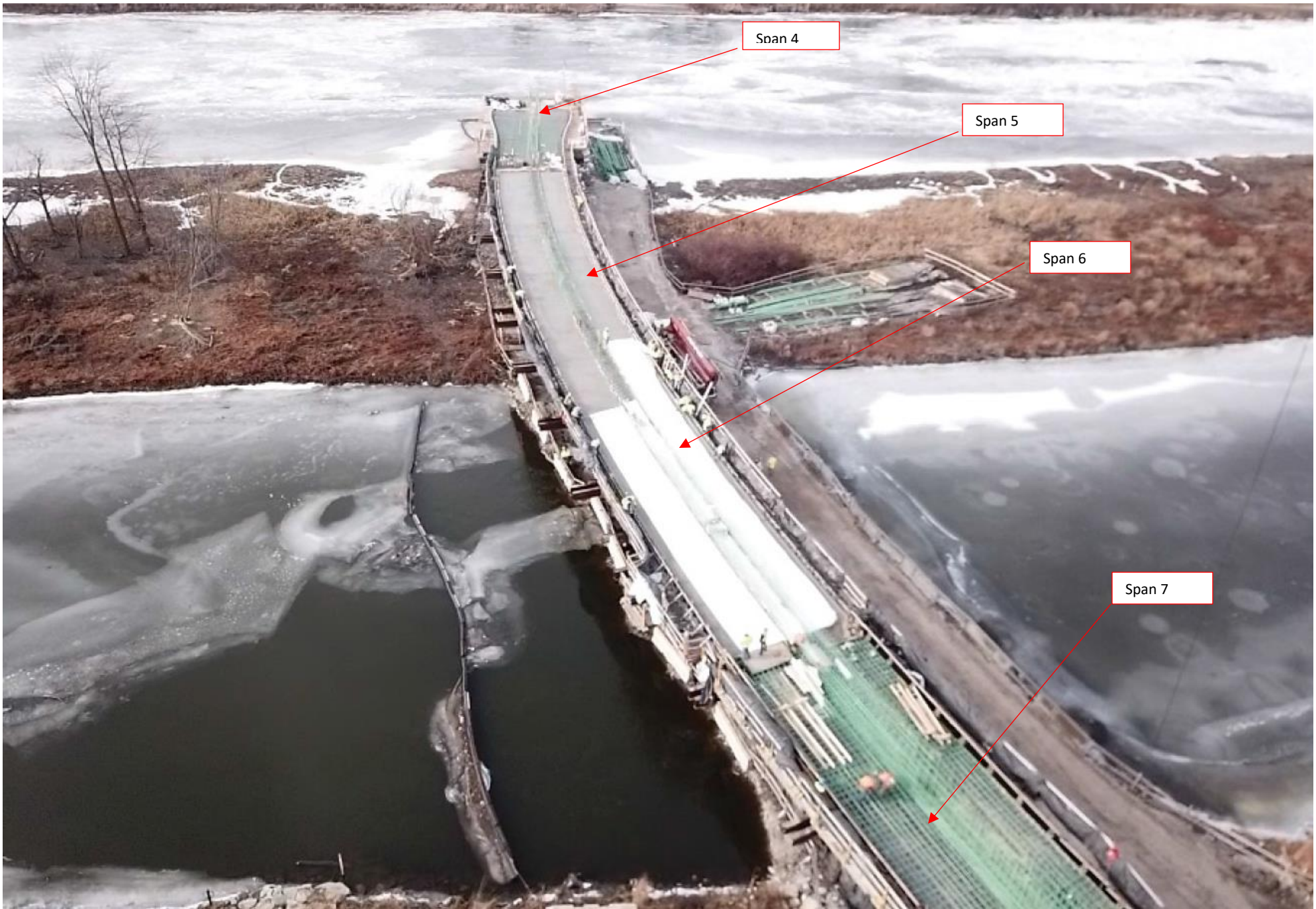
12/23/2019. Aerial view of poured concrete deck at spans 5 and 6. Looking west