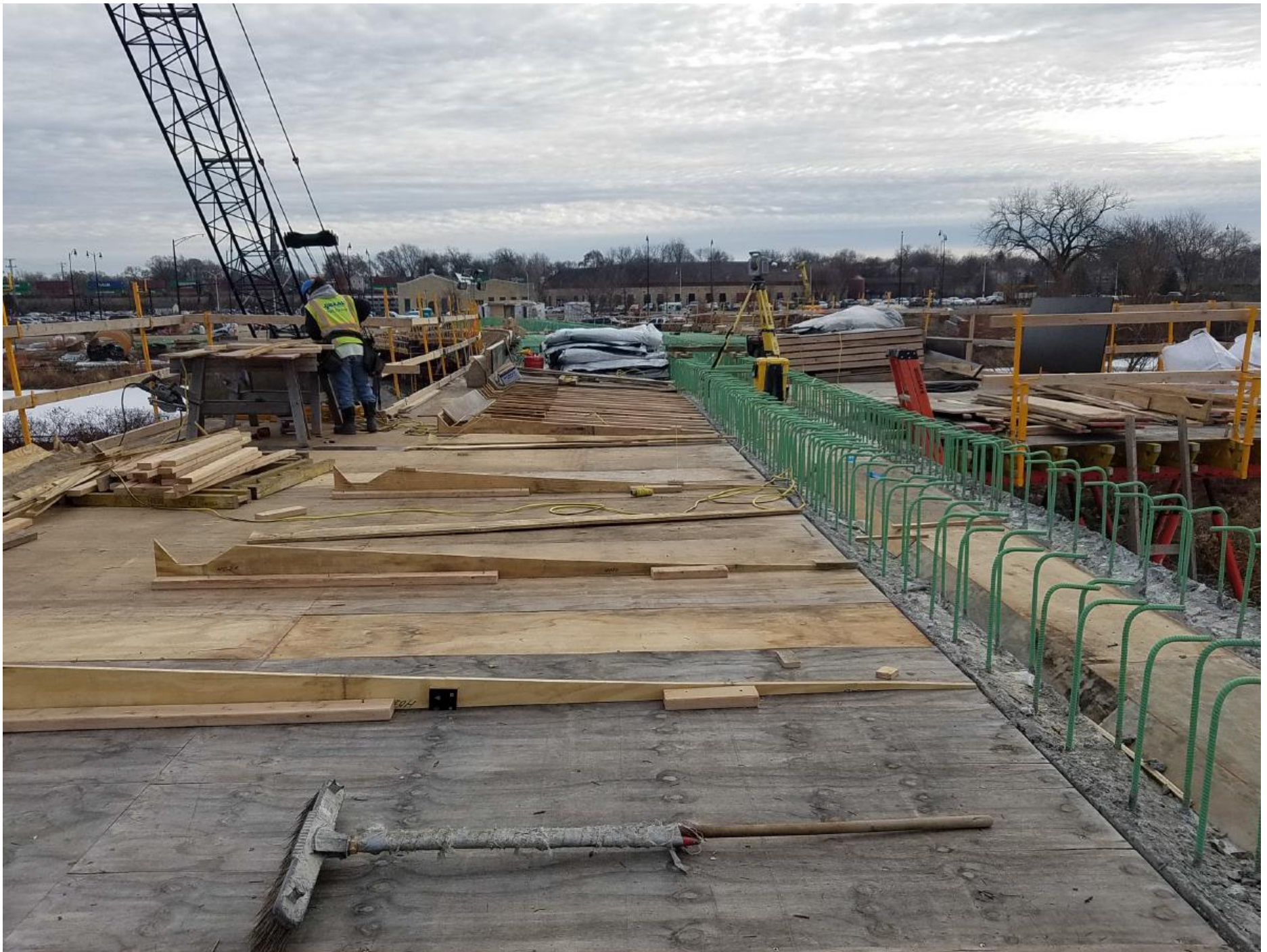
12/12/2019-framing deck at span 4.