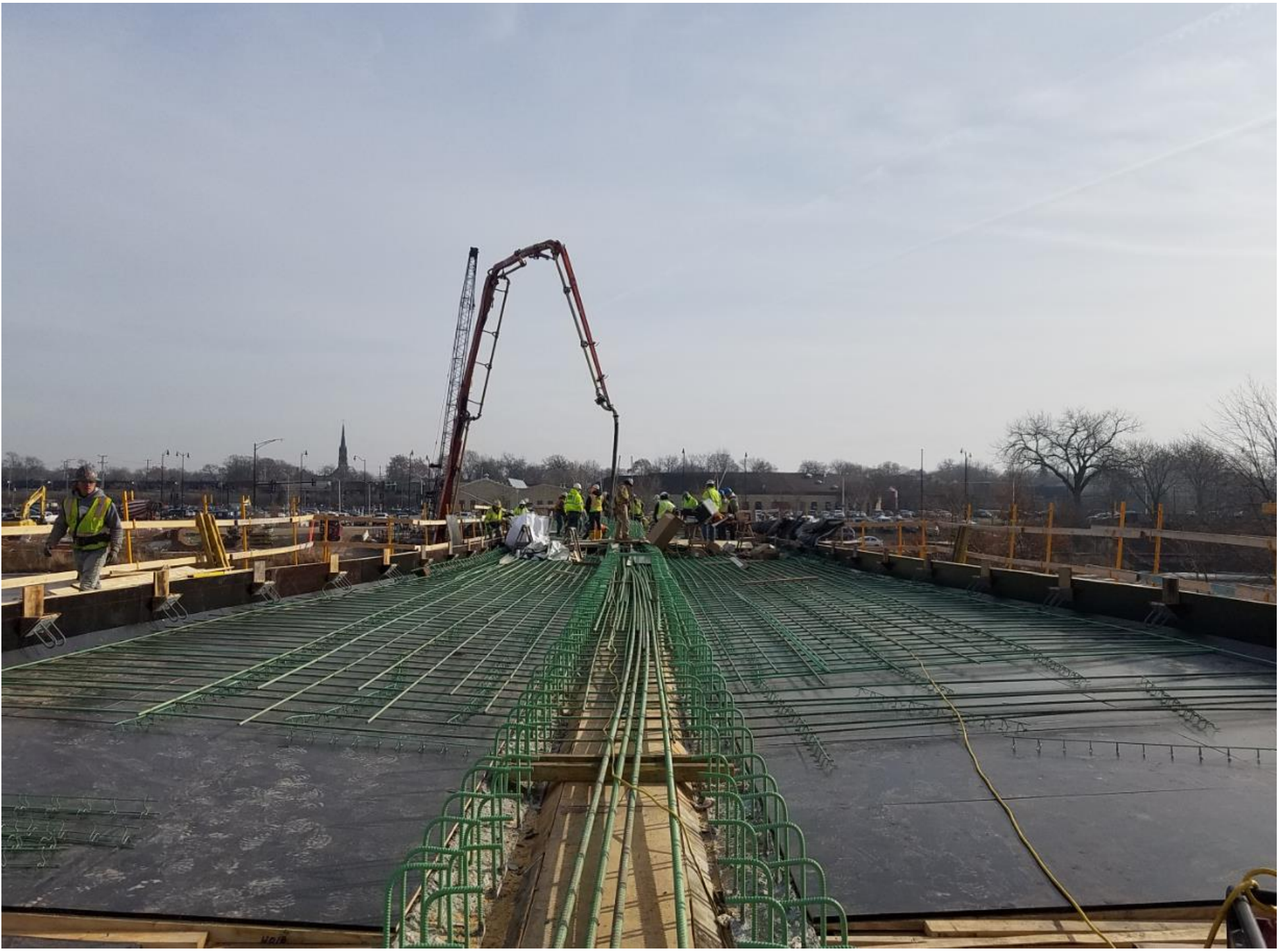
12/20/2019. Pouring concrete deck at spans 5 and 6.