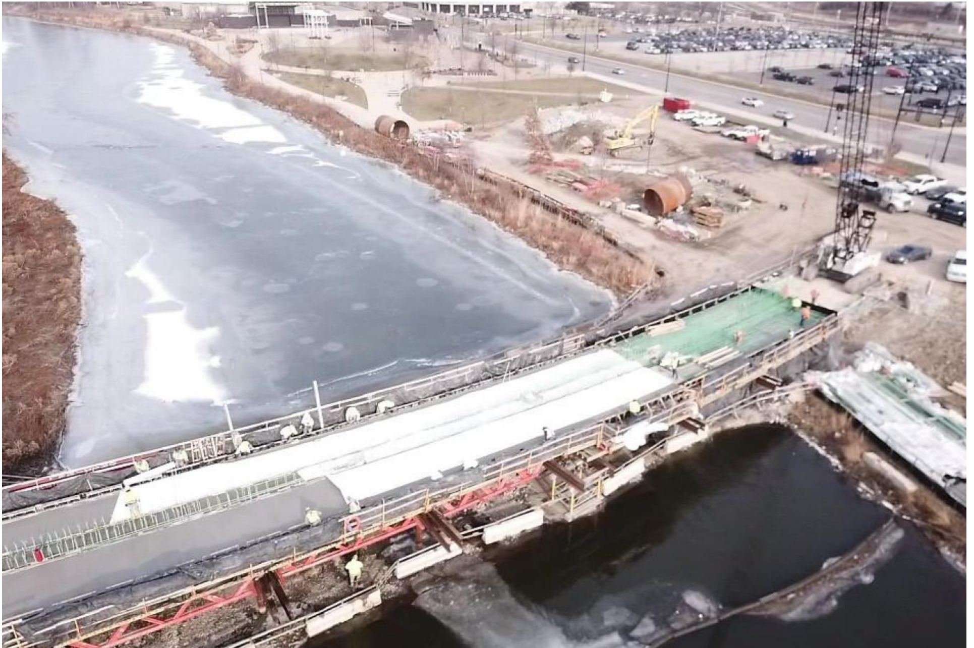
12/23/2019. Aerial view of poured concrete deck at spans 5 and 6. Looking north