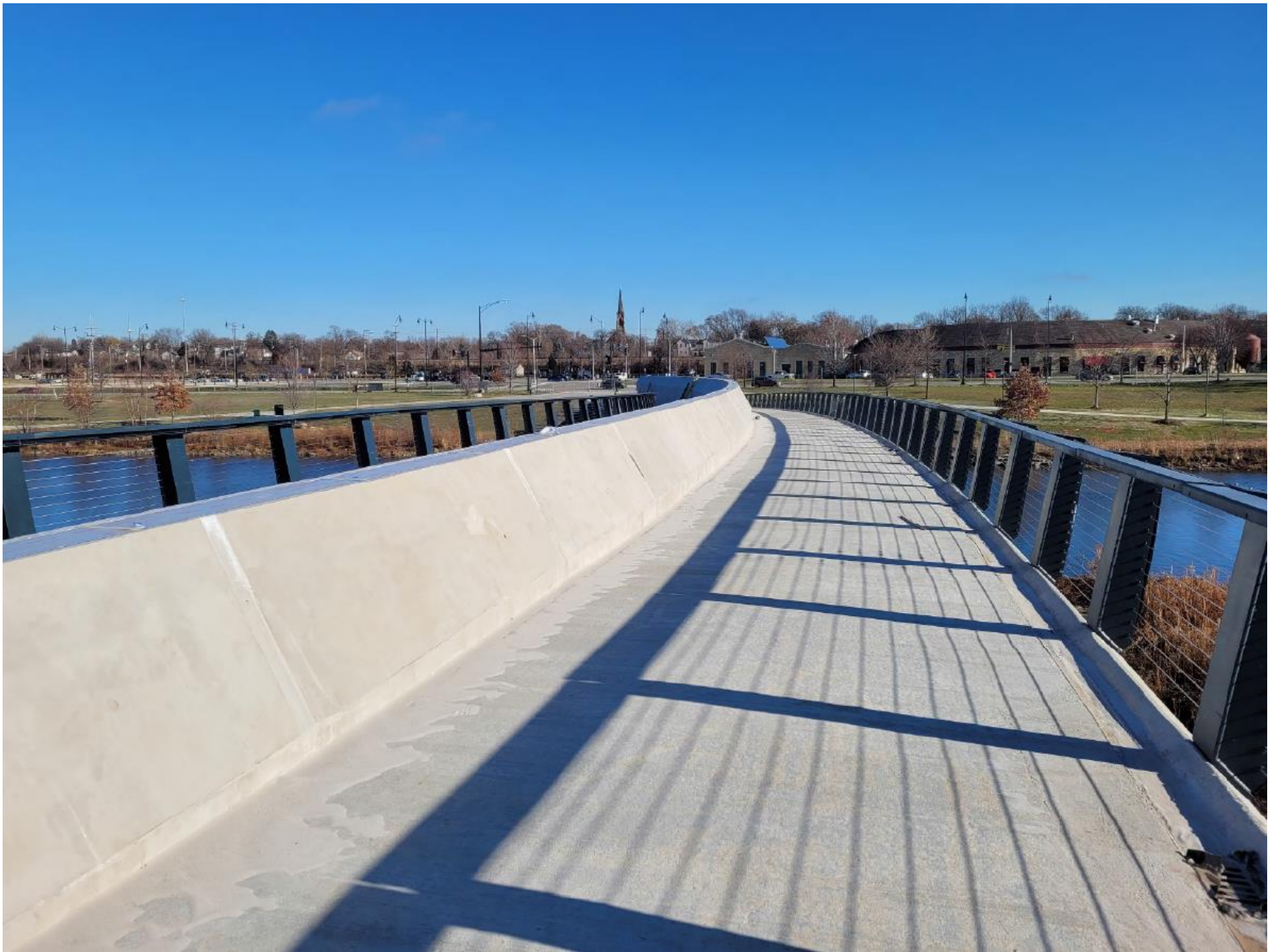
12-1-2020- bridge view- looking east (south side)