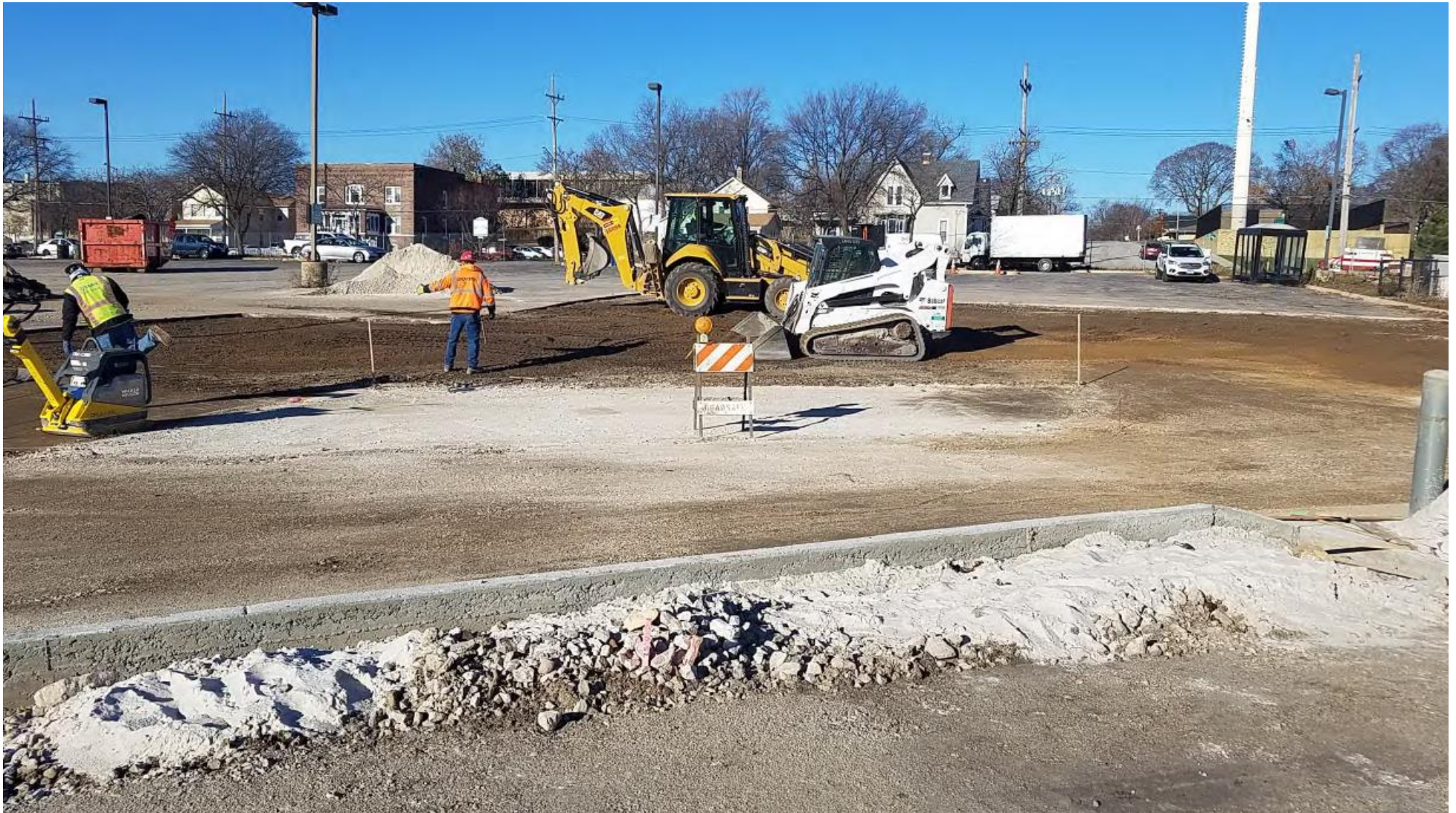
11-17-2020, re-grading of parking lot.