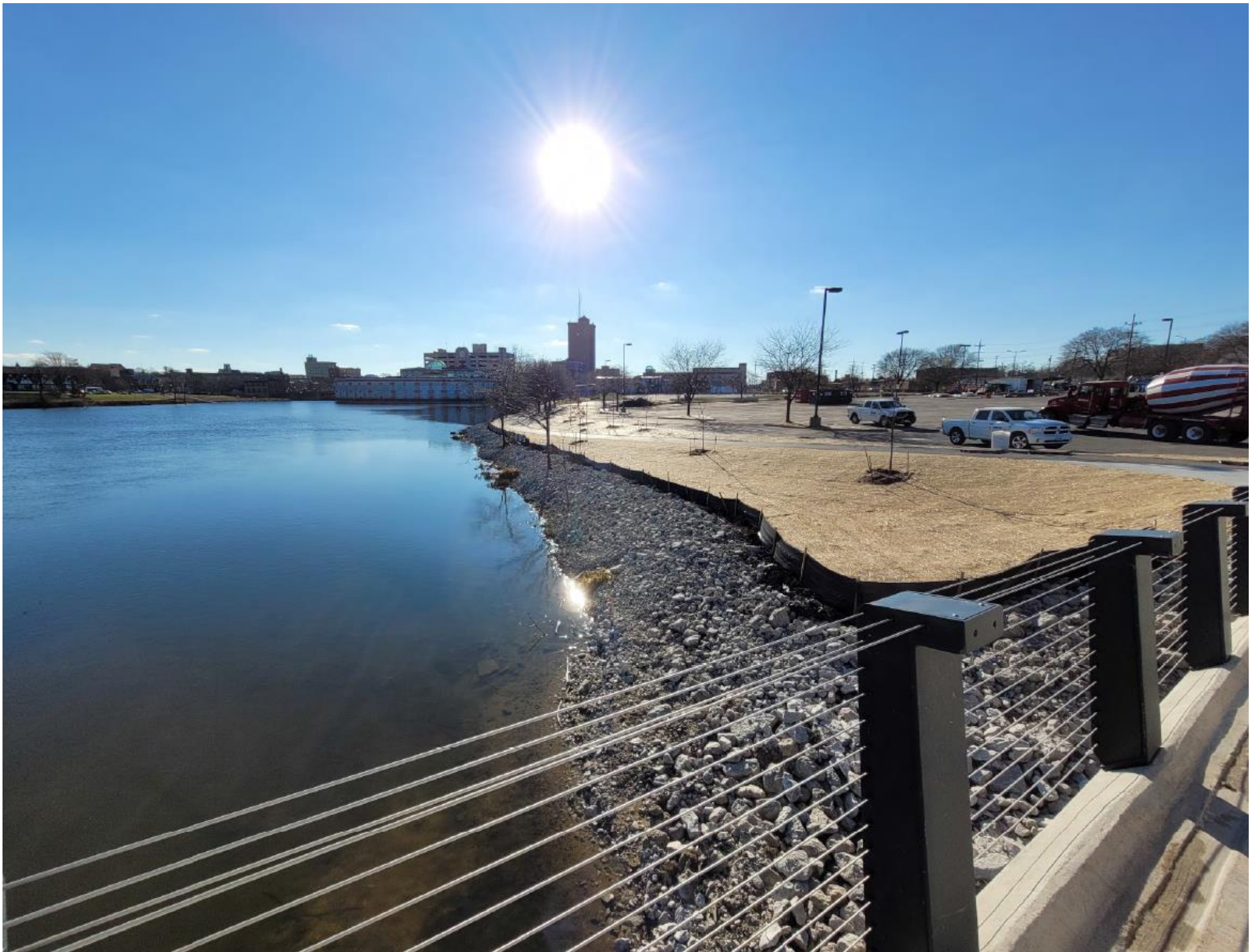
12-1-2020- landscape restoration (looking SW)