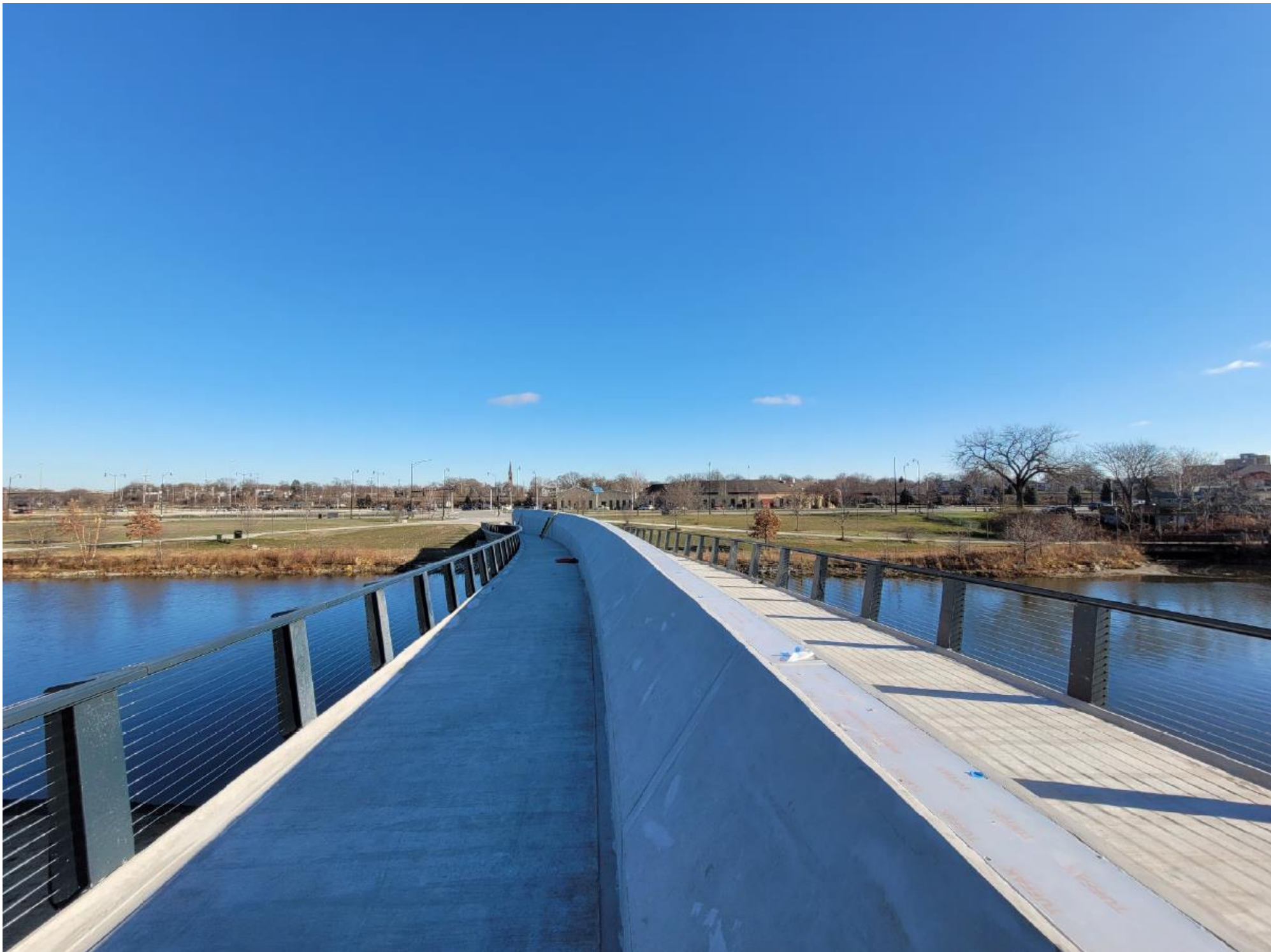
12-1-2020- bridge view- looking east (north side)