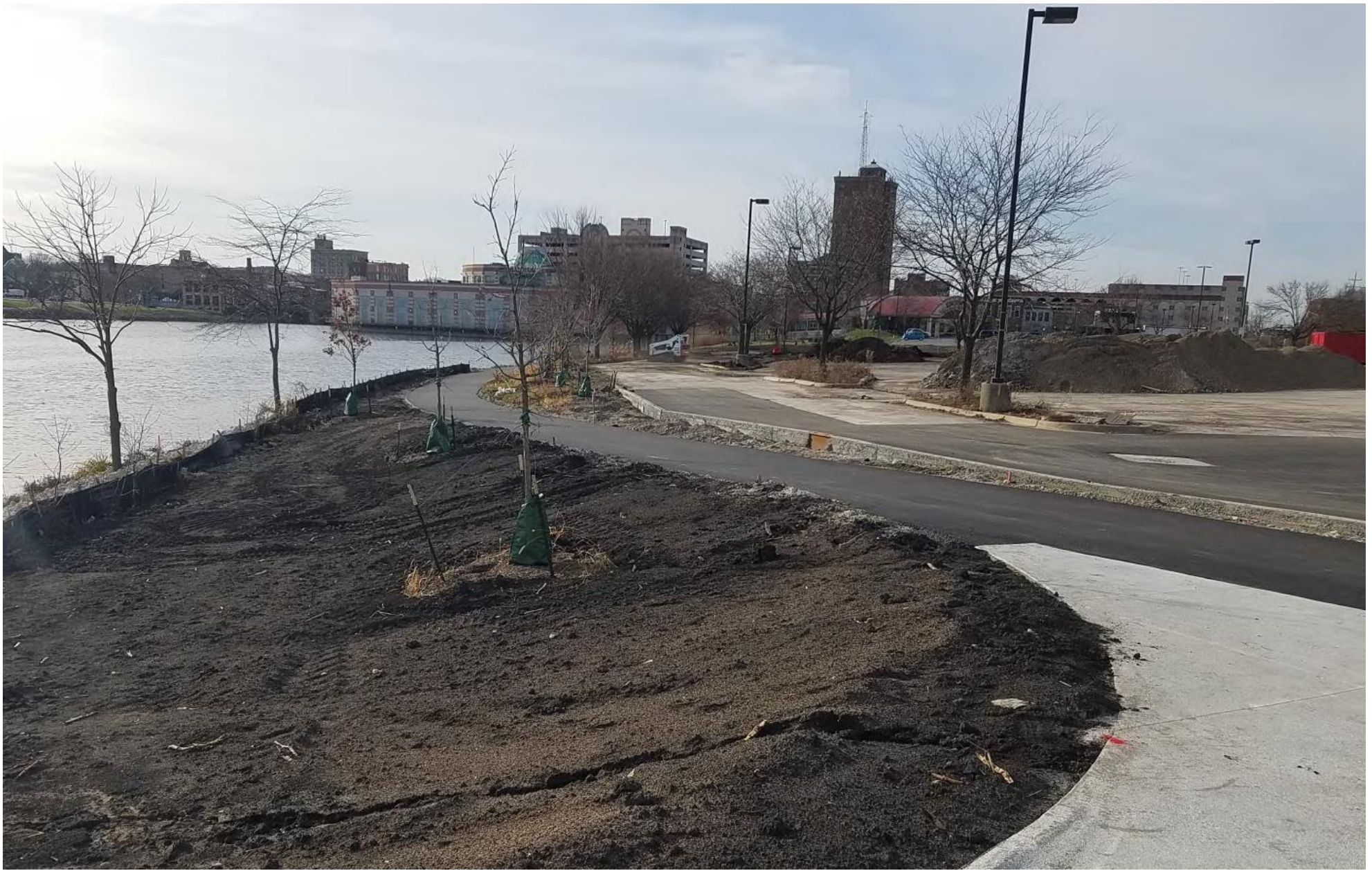
11-19-2020- grading of west shoreline bank (looking south)