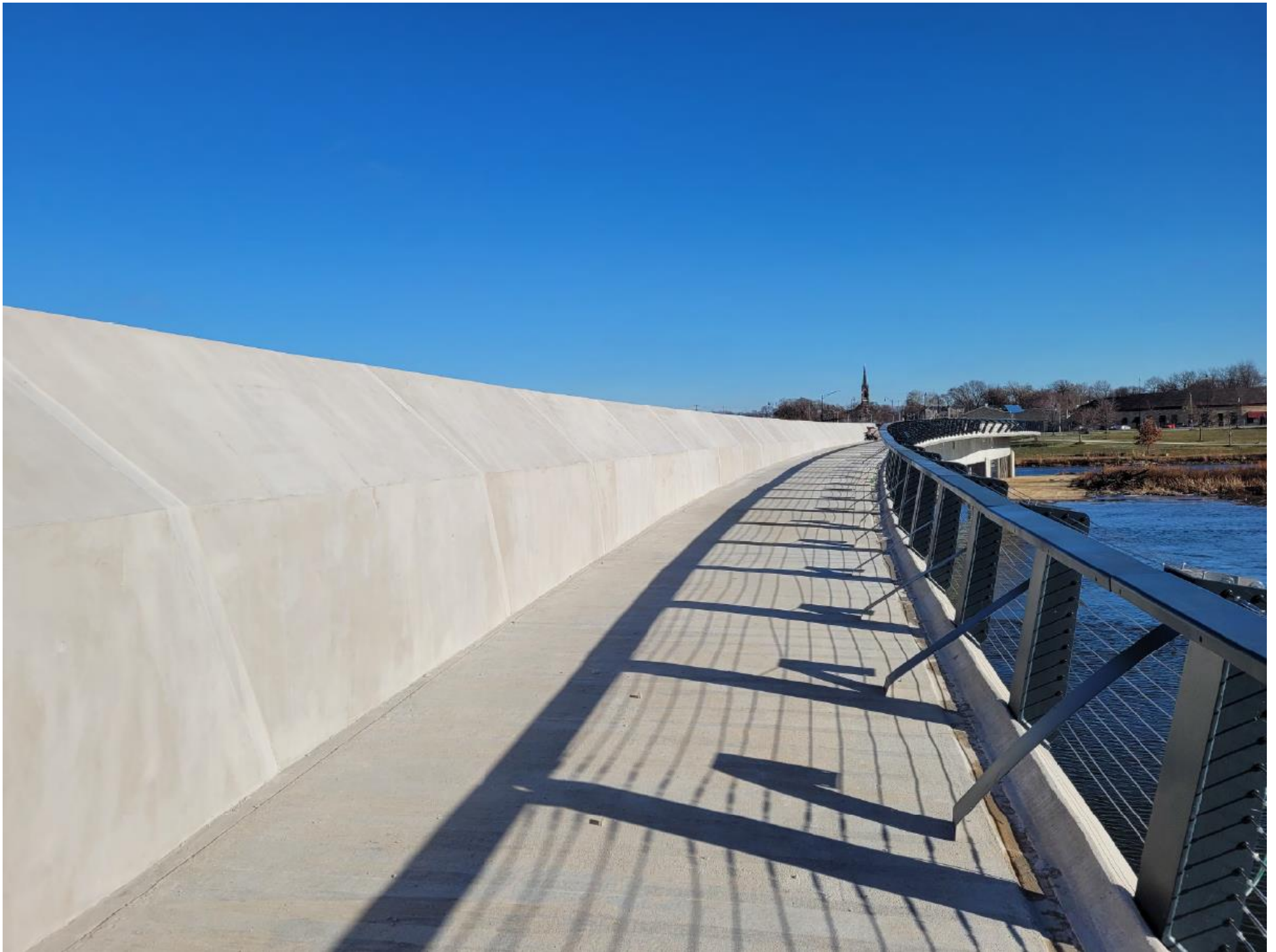
12-01-2020- bridge view, looking east (south side)