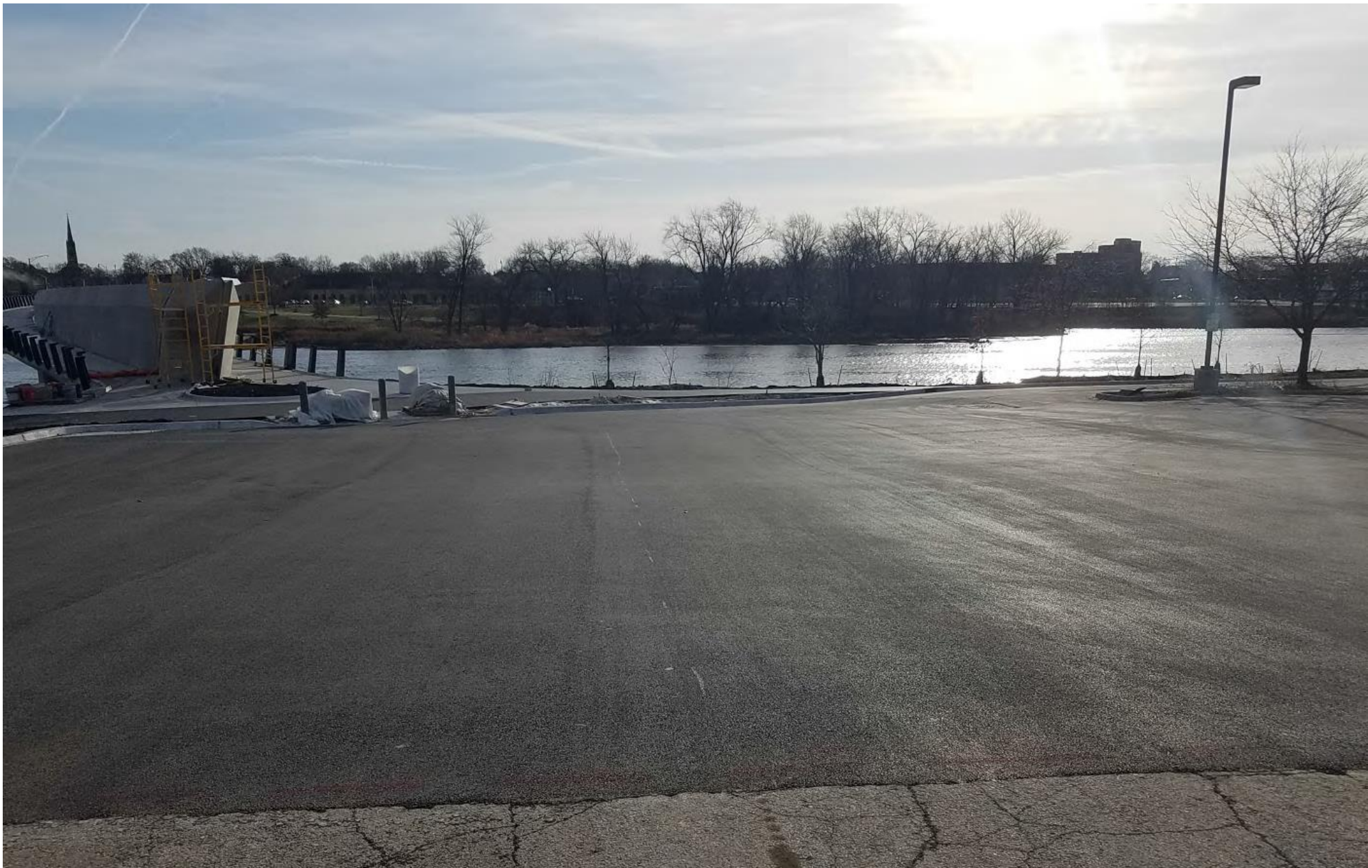
11-19-2020- paving of parking lot (looking east)