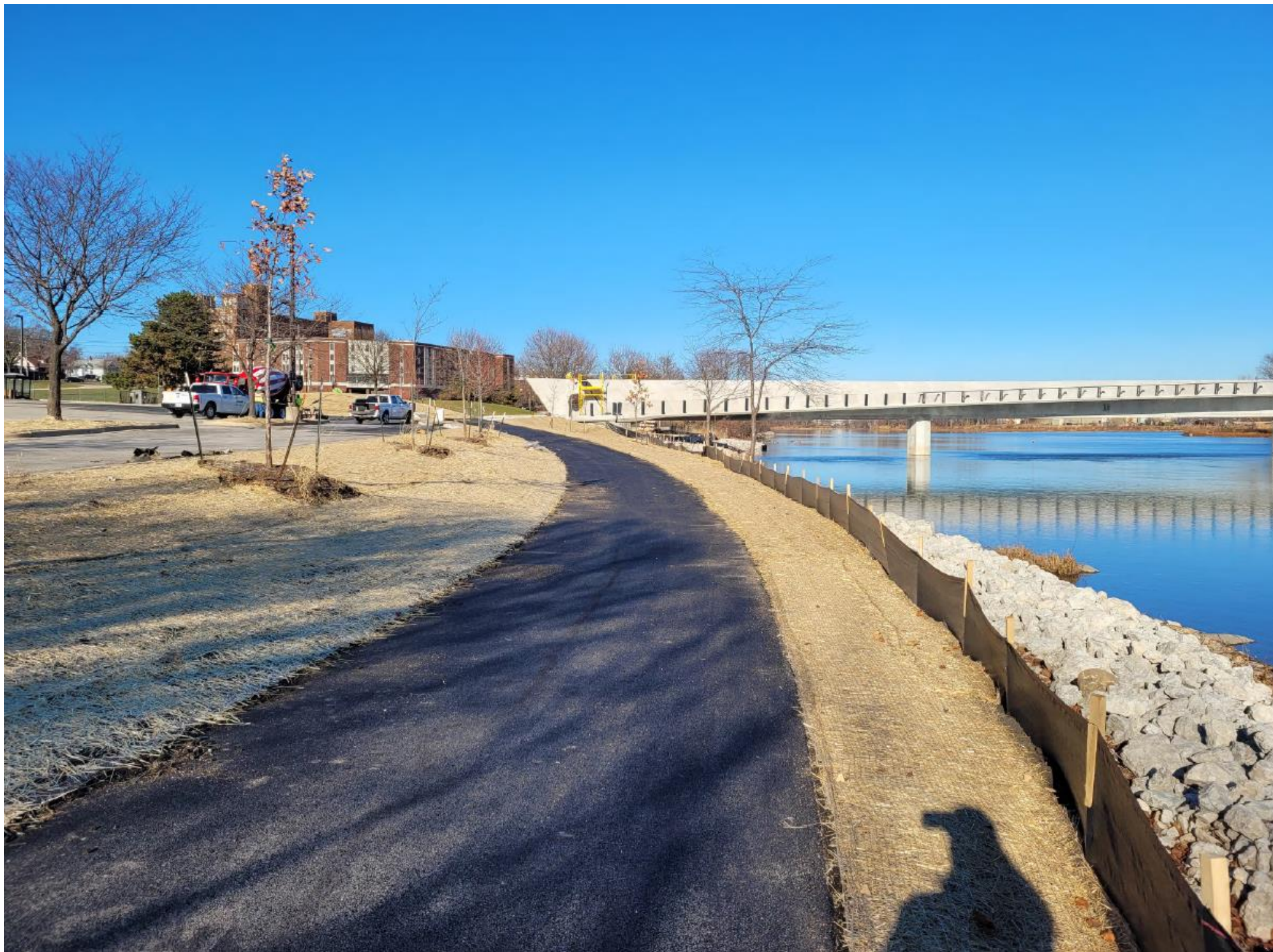
12-1-2020-restoration and installed bike path (looking north)