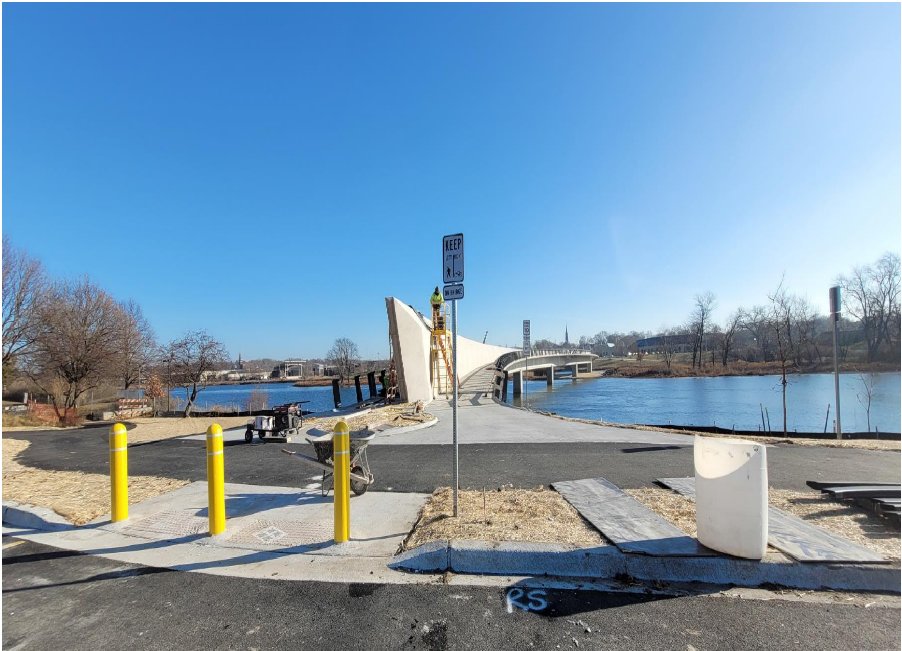
12-09-2020- installation of modular expansion joint and signage