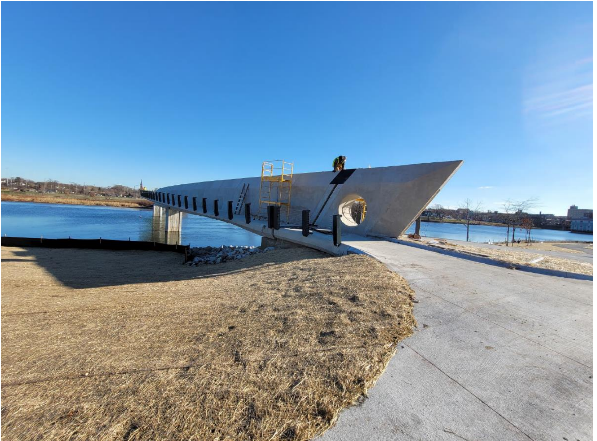
12-1-2020- installation of modular expansion joint (west side). Bridge view looking east.