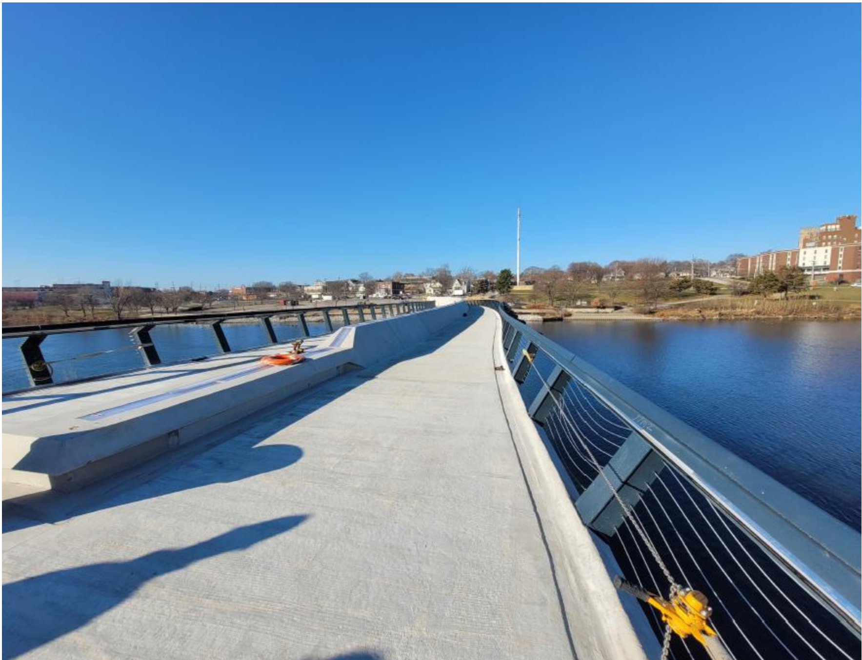
12-09-2020- bridge view looking west (north side)