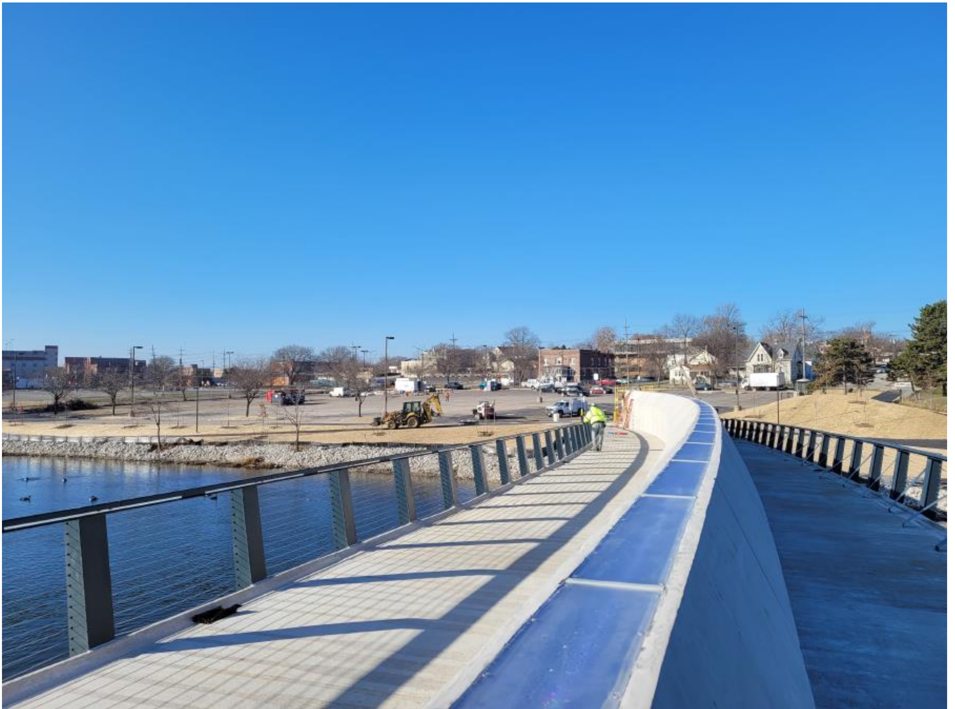
12-09-2020- Placing caulk at railing posts, looking west.