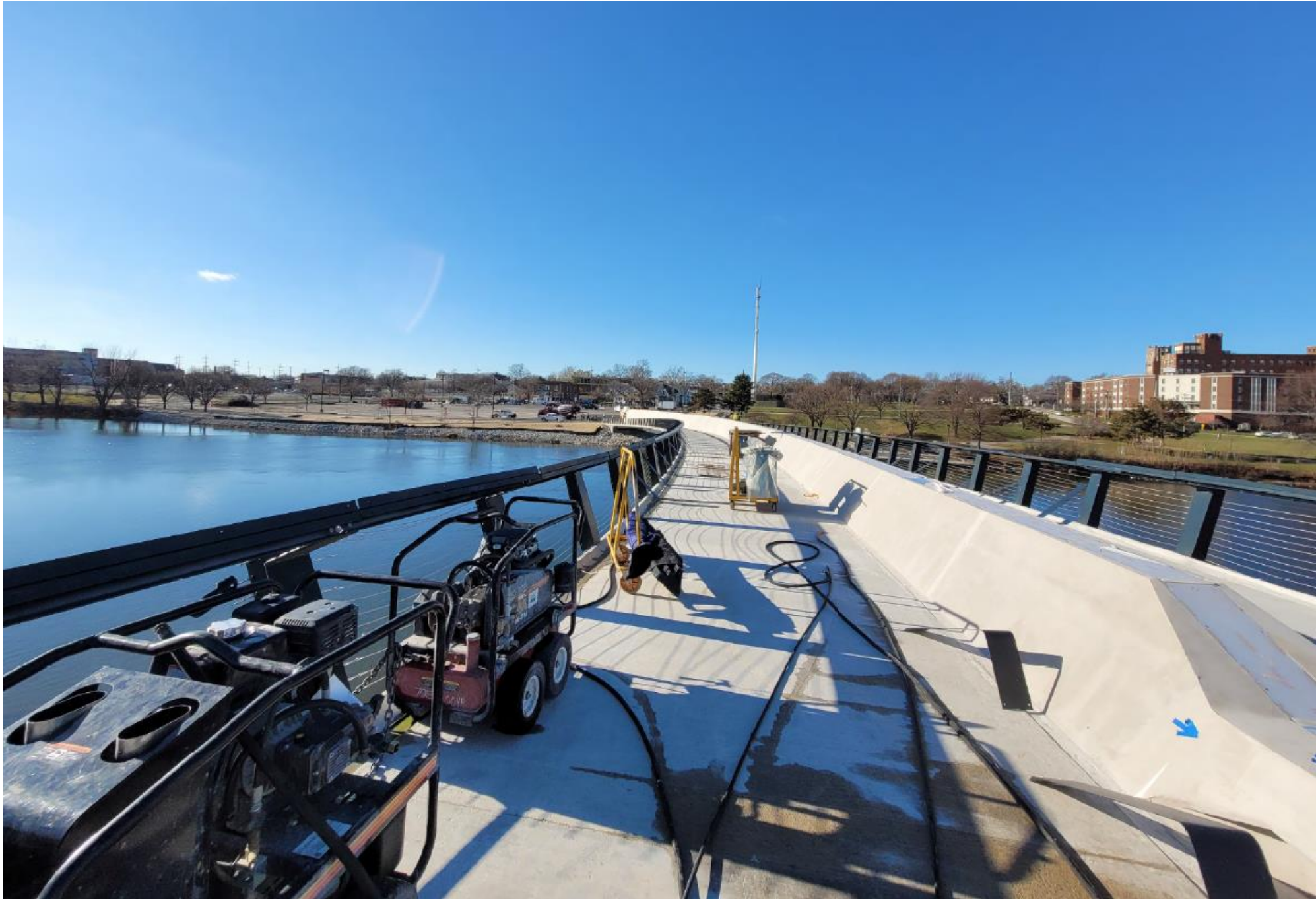
12-1-2020- bridge view- looking west (south side)