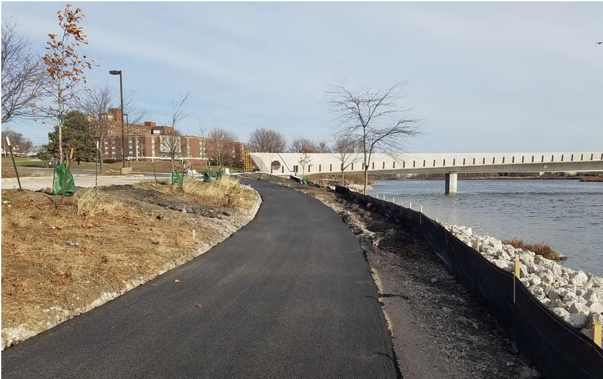
11-19-2020- paved bike path (looking north)