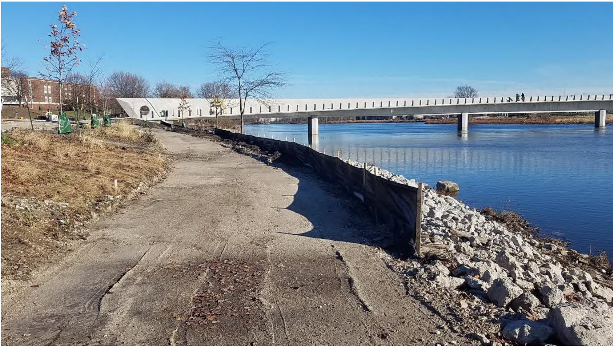
11-17-2020- grading for the bike path (looking north)