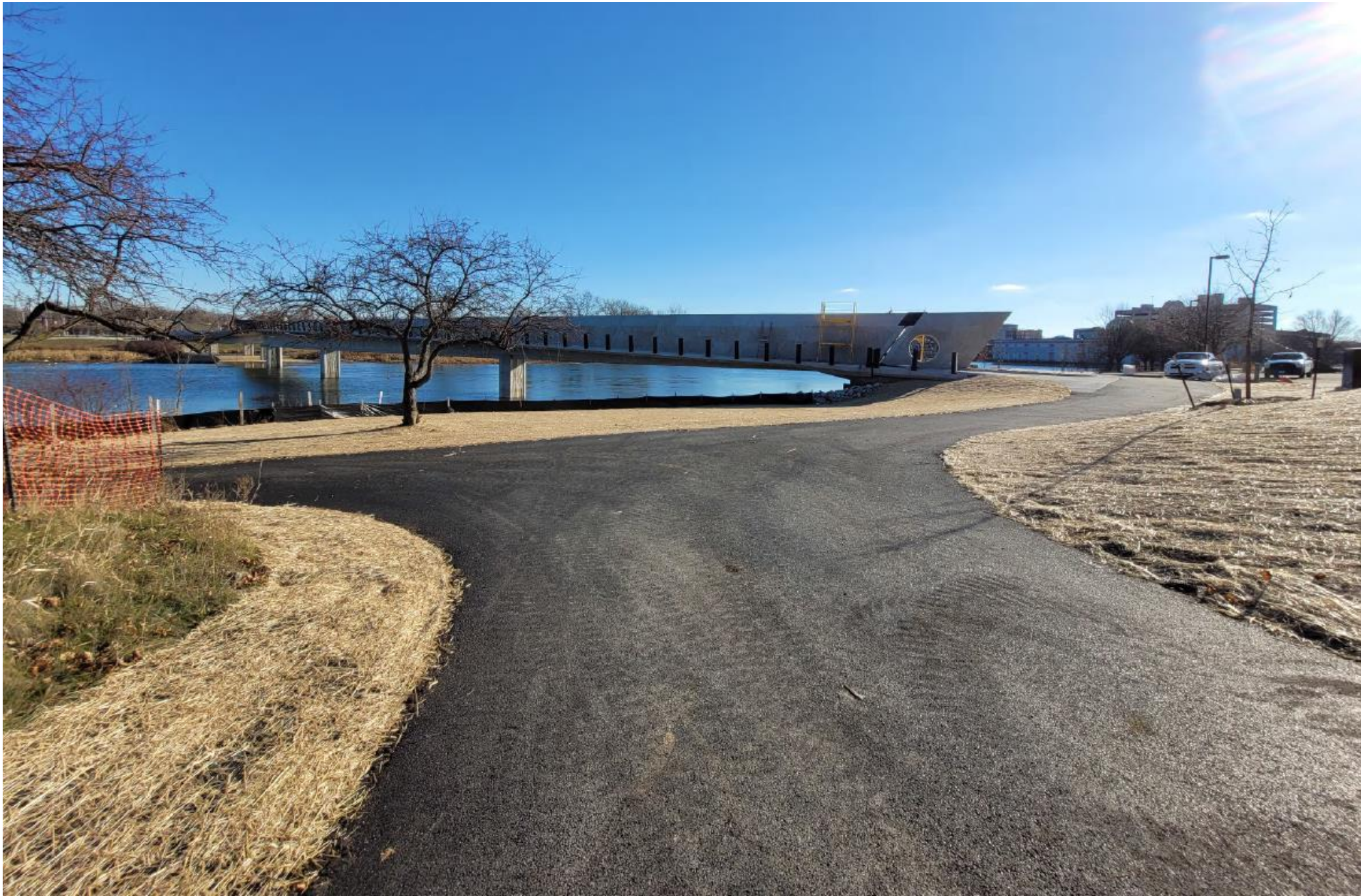
12-1-2020- restoration and installed bike path (looking south)