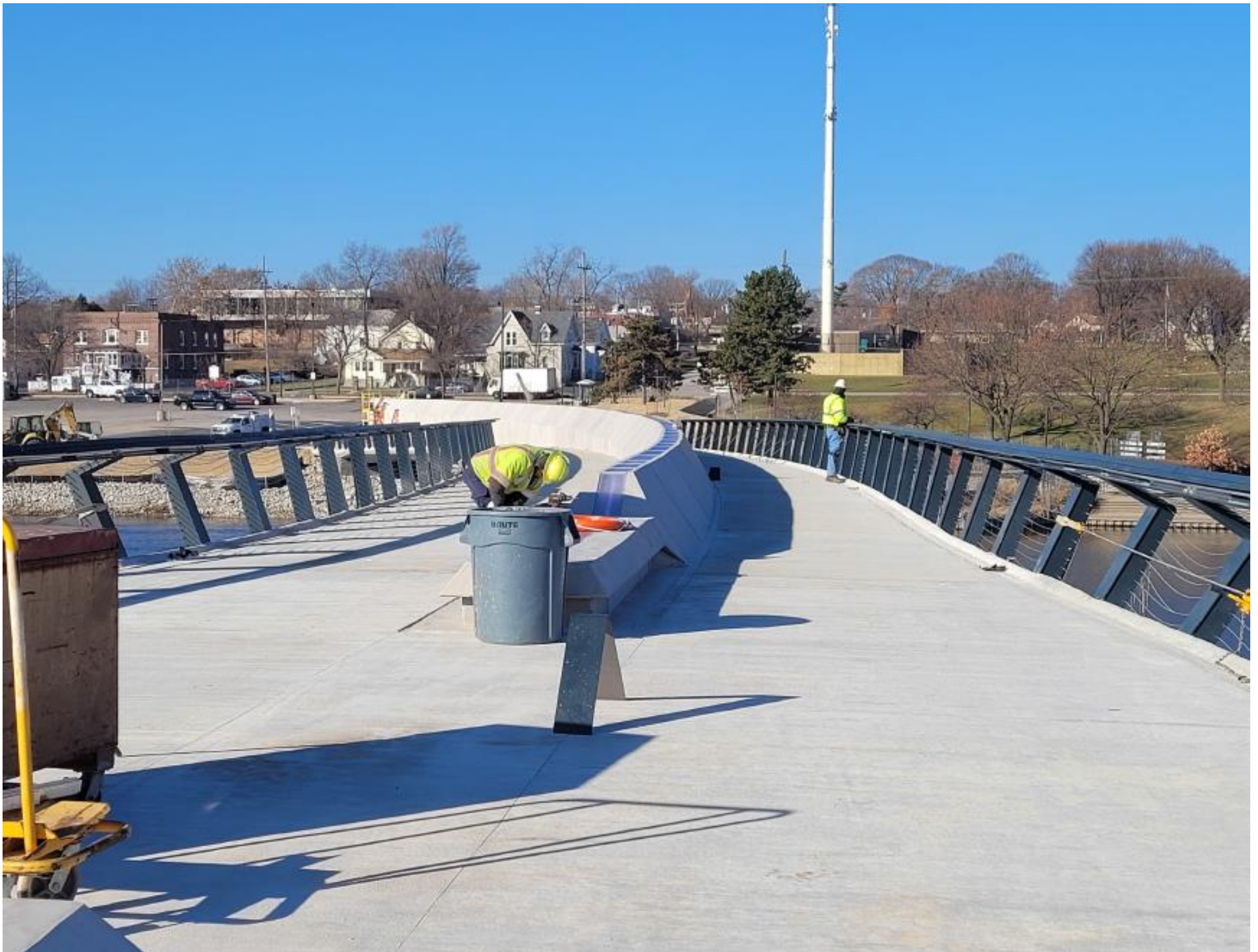
12-09-2020- installation of bridge handrail LED lights