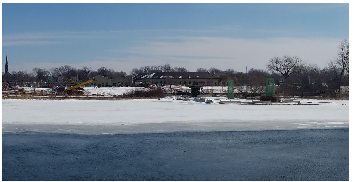
Looking East 02/21/2019