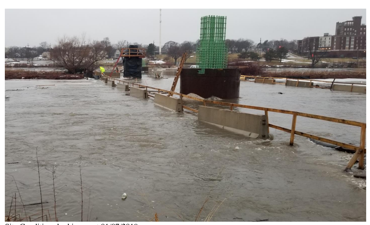
Site Condition- looking west 01/07/2019