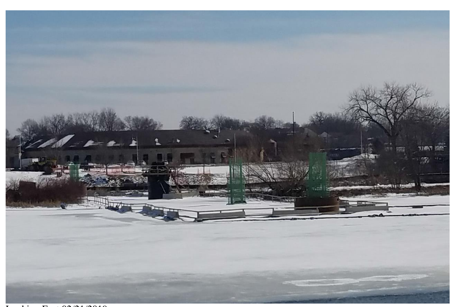
Looking East 02/21/2019