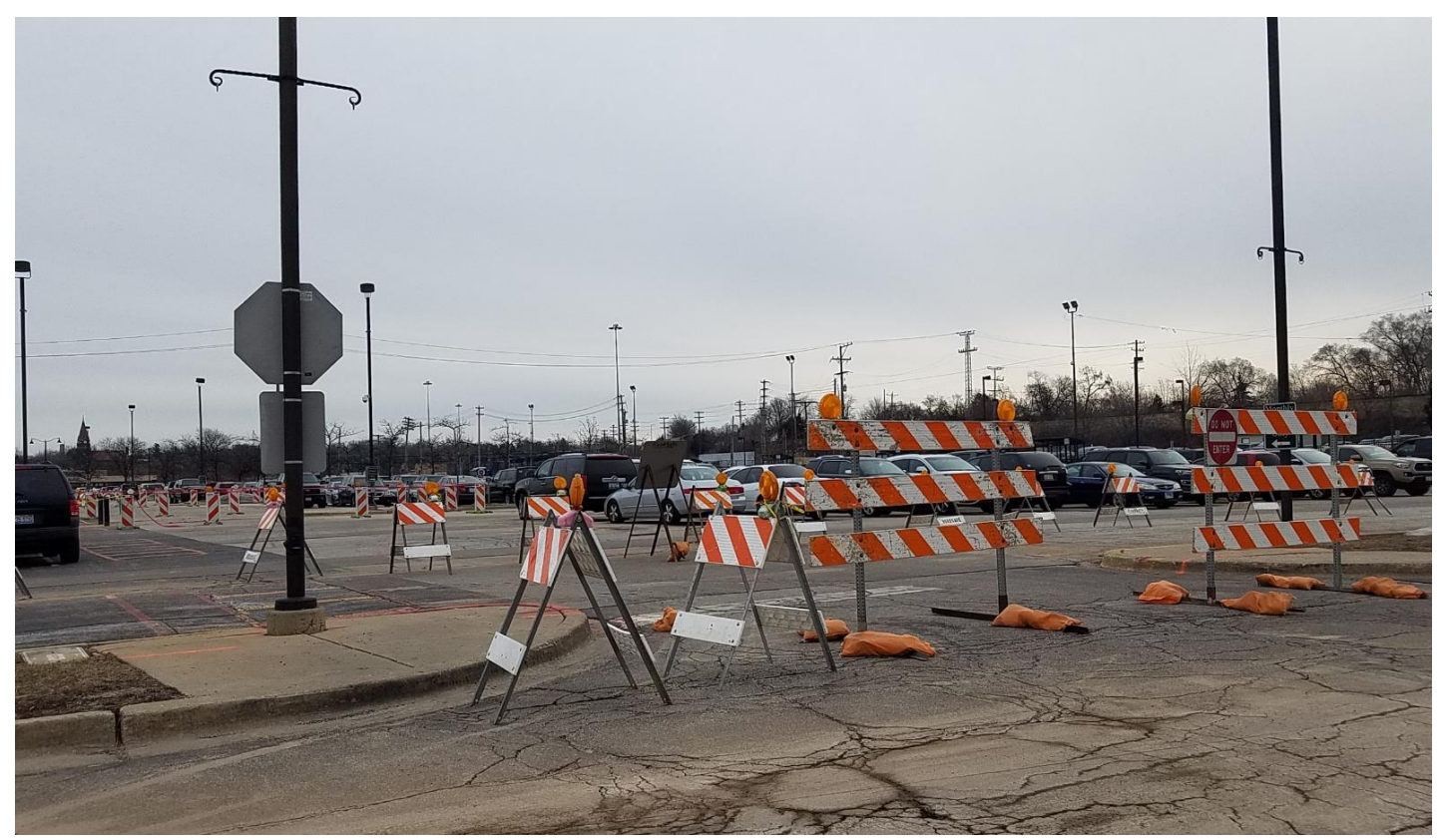
ATC Parking Lot, start of Stage 4 work. Middle drive aisles are closed. Looking north 02/28/2019