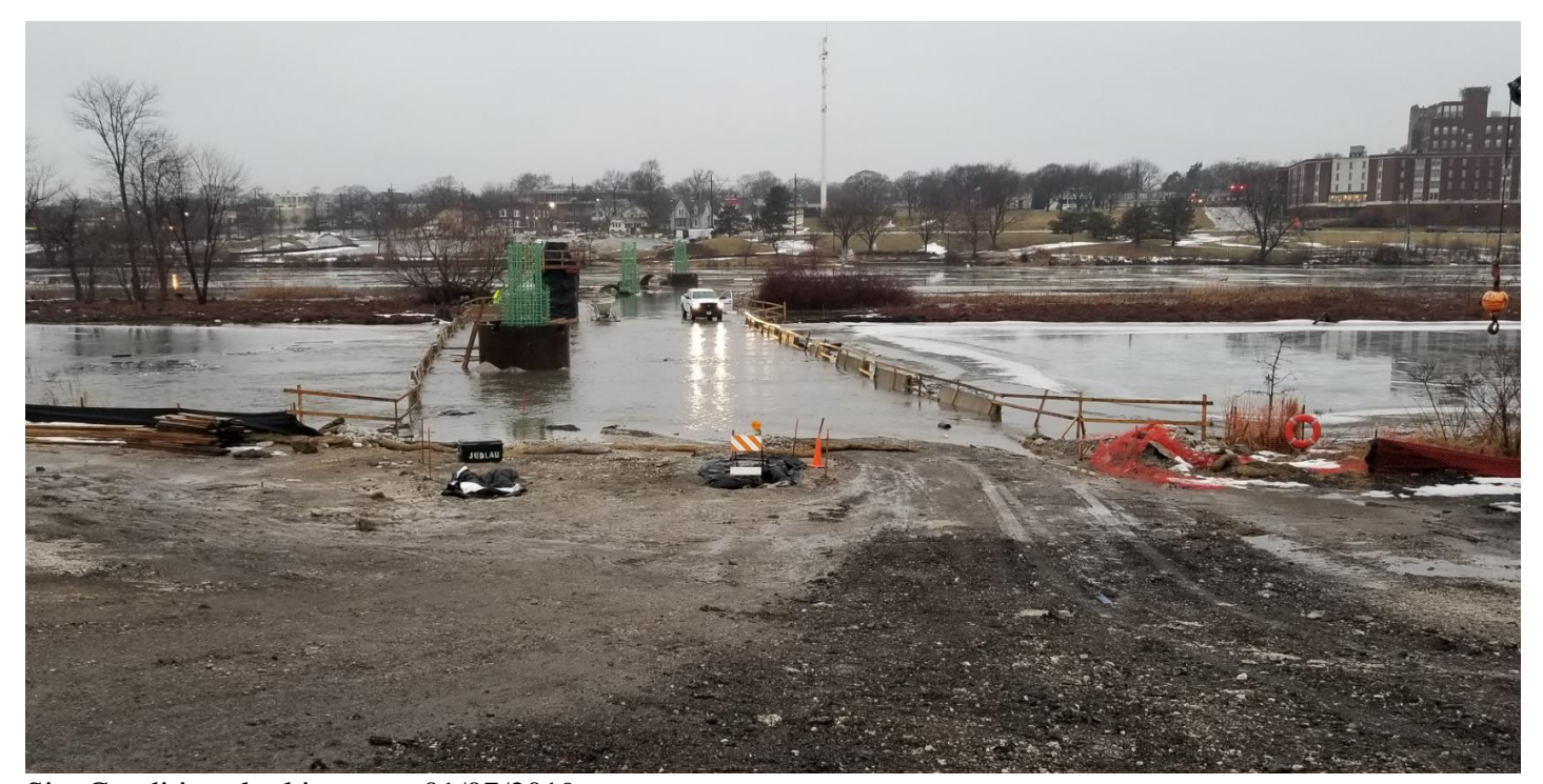
Site Condition- looking west 01/07/2019