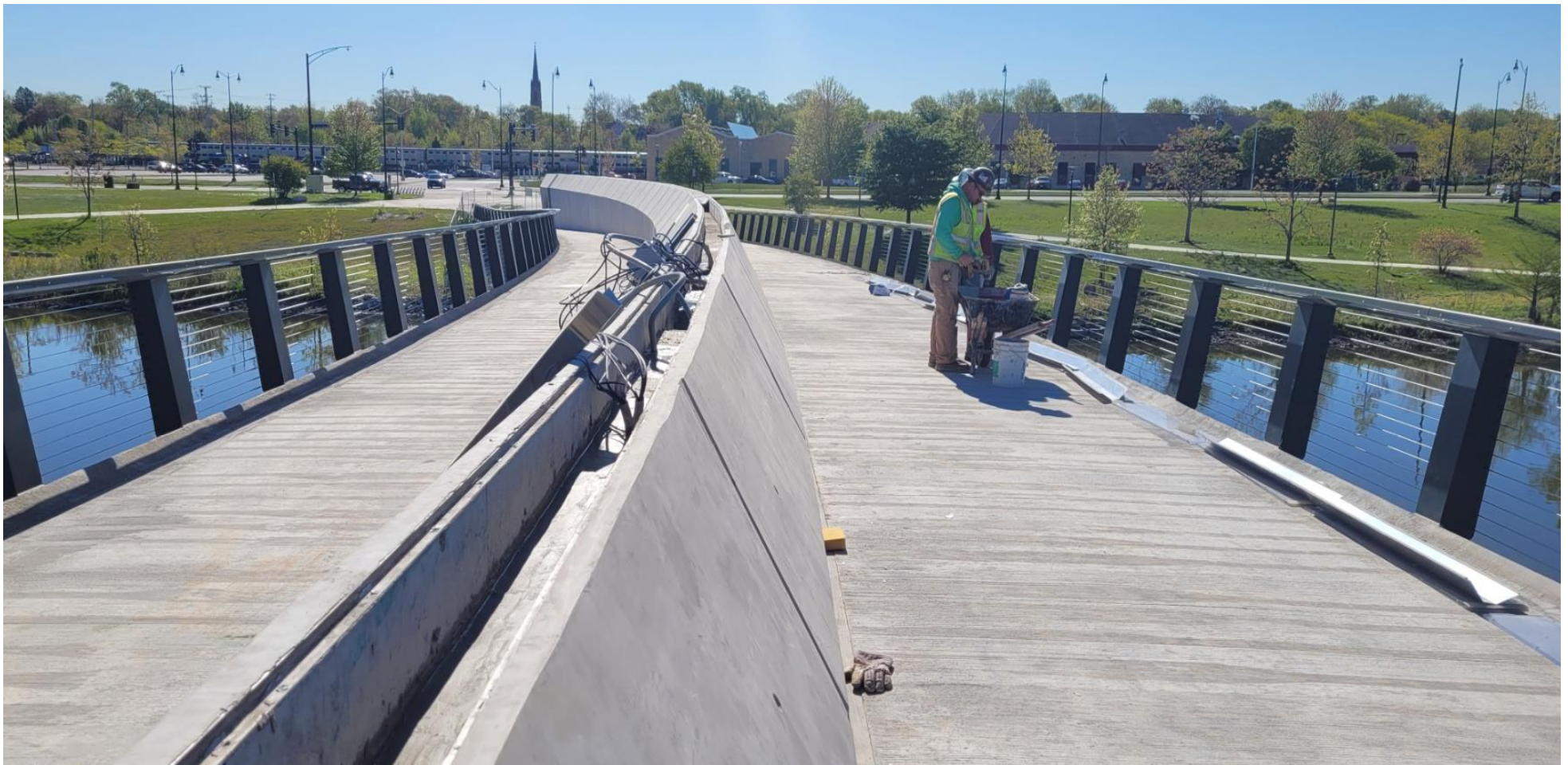
05/12/2021-Continue cornice channel work. Looking east. Spans 5-7