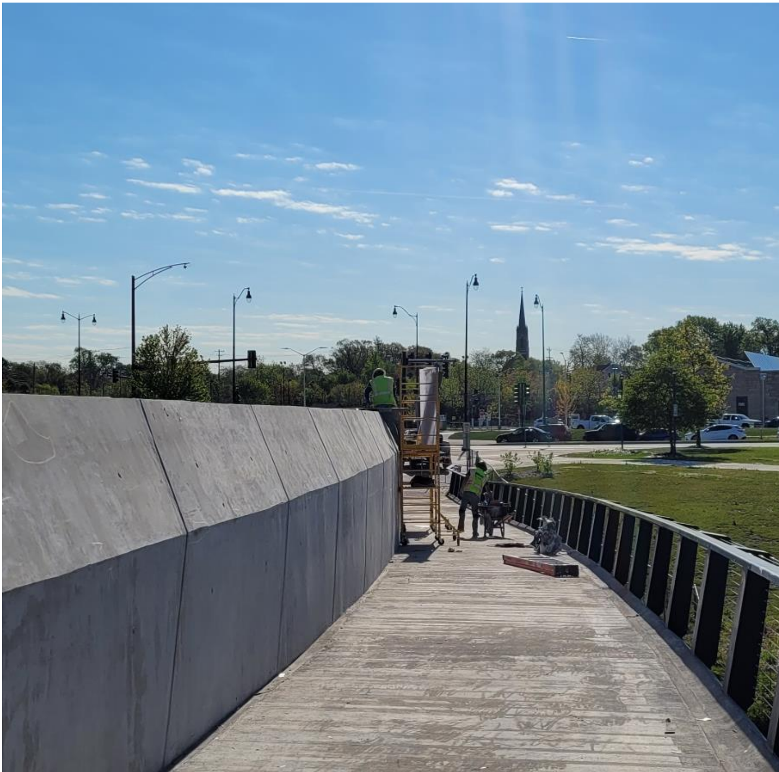
05/14/2021-Contractors continue work