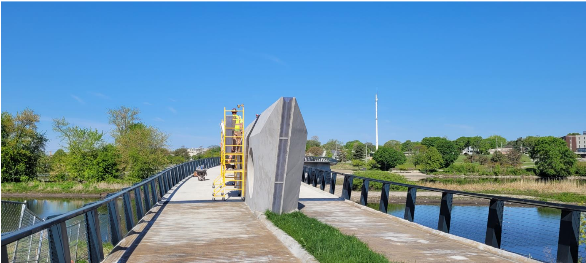
05/14/2021-Contractors continue cornice channel work. Spans 5-7. Looking west