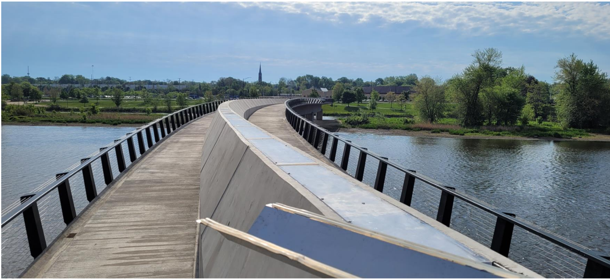
05/20/2021-Looking east. Electrical work. Span 1- Looking east