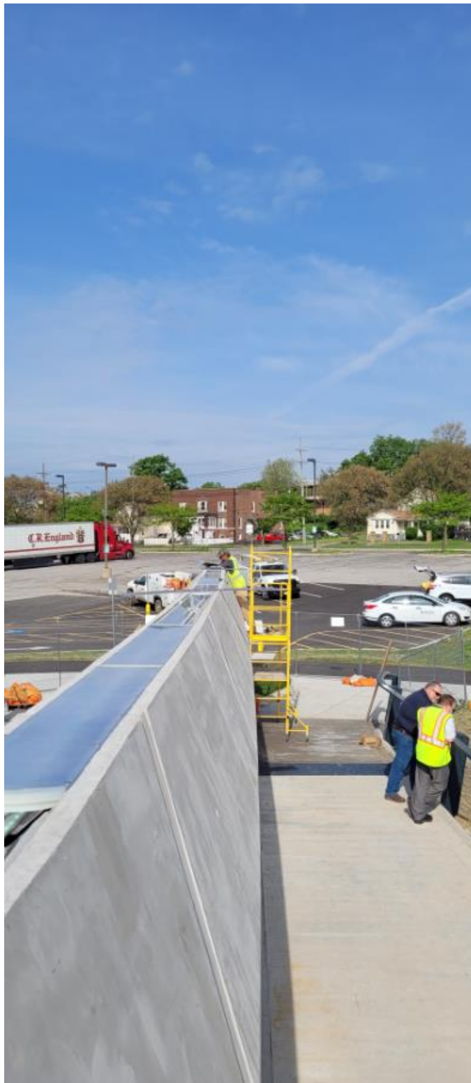
05/20/2021- electrical work-Span 1- looking west