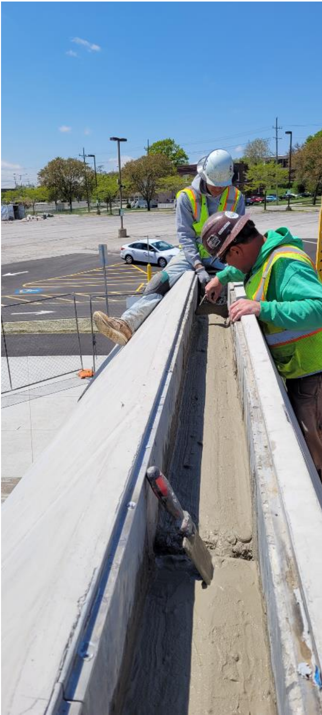
05/10/2021-Applying additional concrete in bottom of channel, sloping channel to drain to drain pipe. Spans 1-4