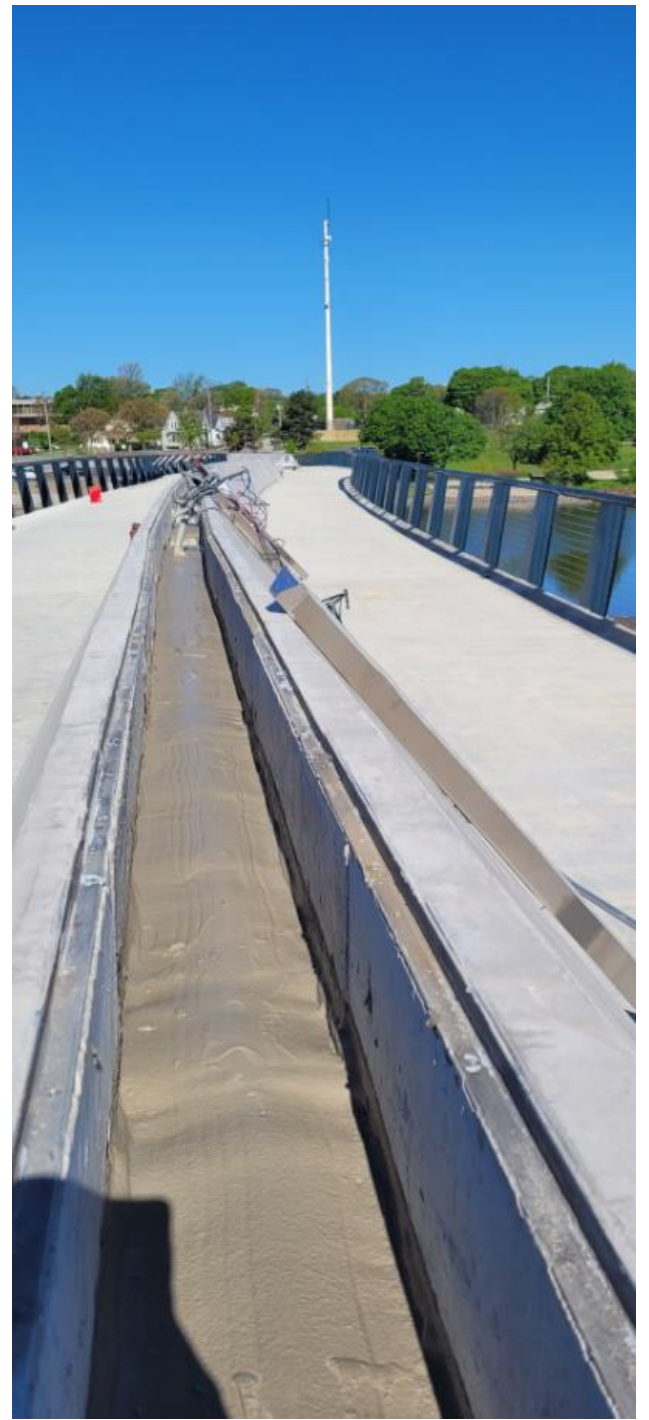
05/12/2021-Continue cornice channel work, sloping channel to drain to drain pipe. Span 5-7