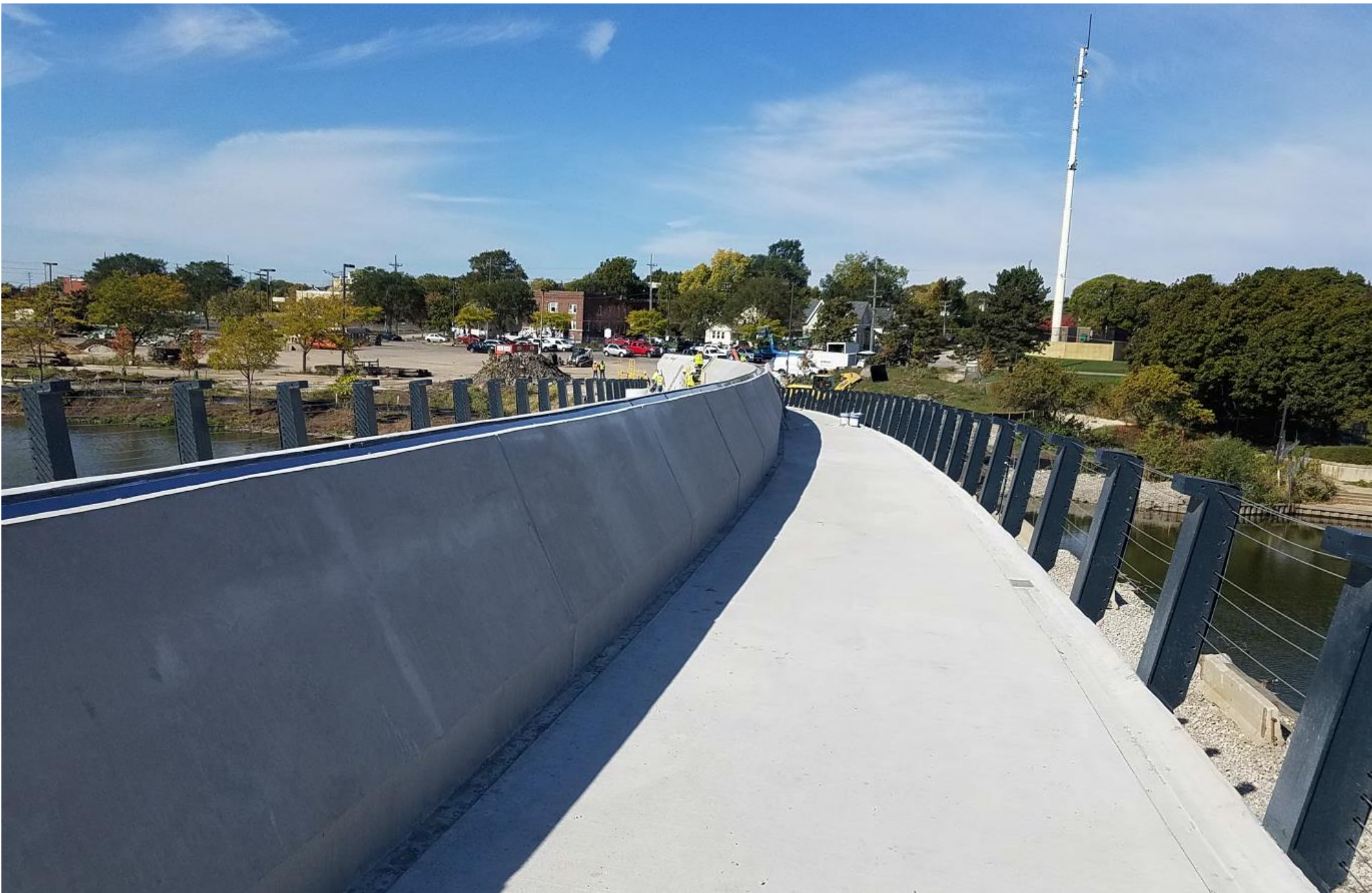
Upper Box, Looking west. 10/08/2020