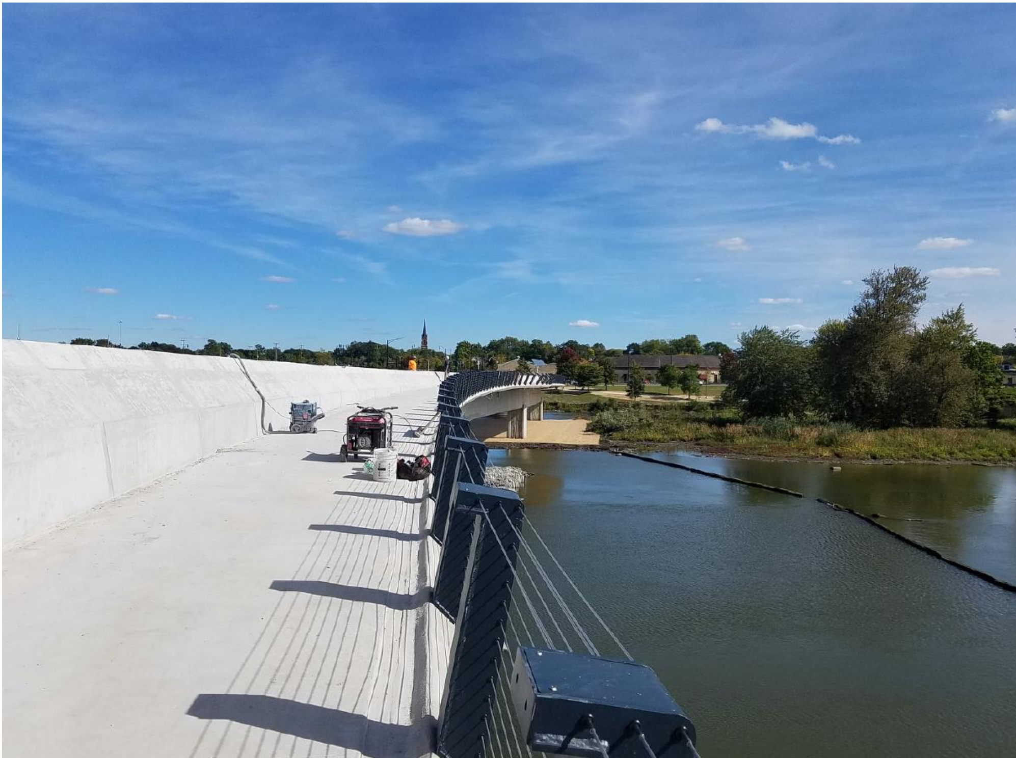
Patching of upper box- 10/02/2020. Looking east