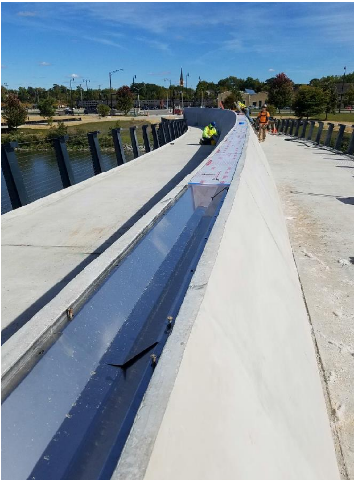
Installation of cornice bridge lighting. 10/02/2020