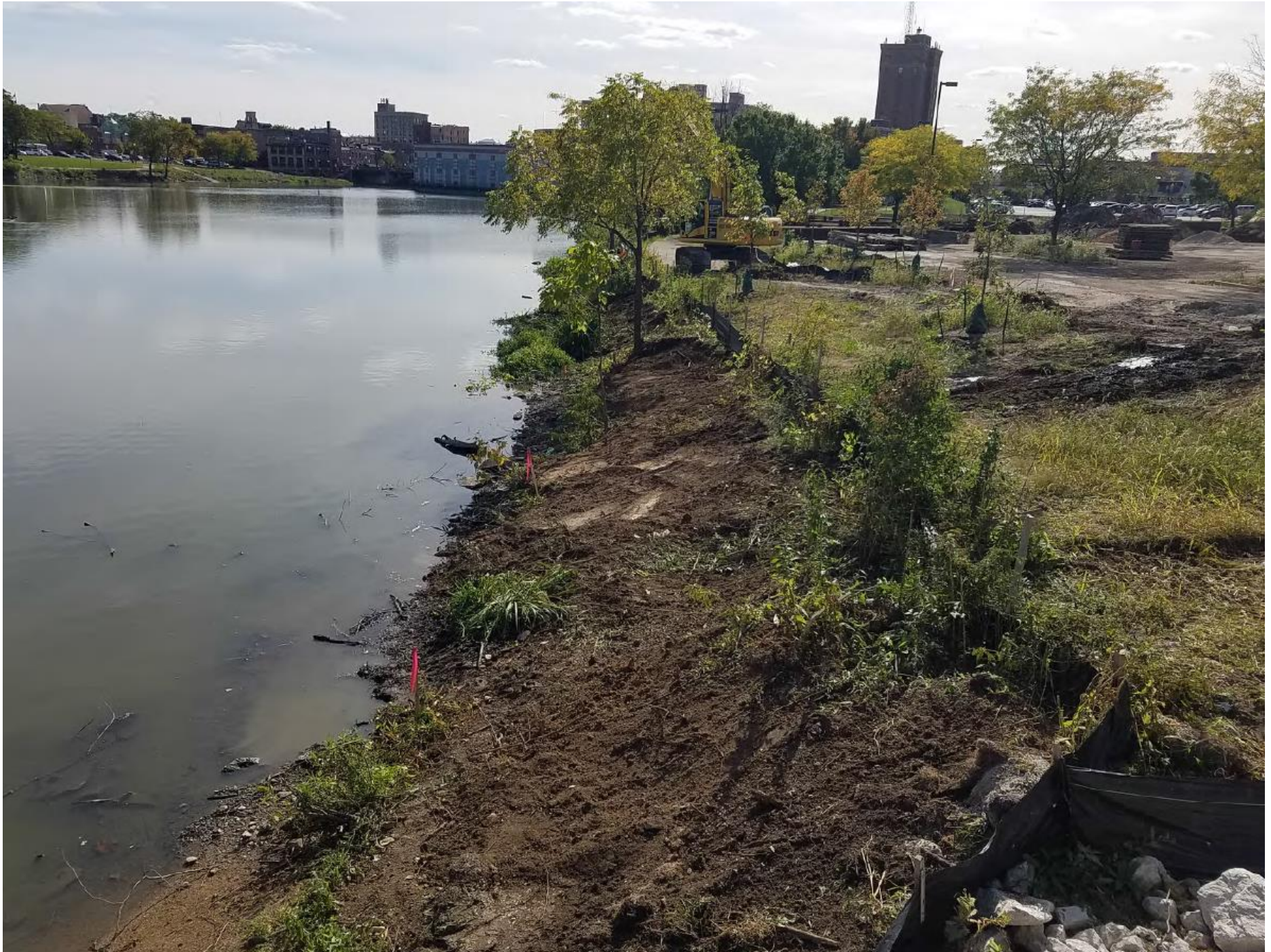
Re-grading of east river bank- 10/02/2020. Looking south