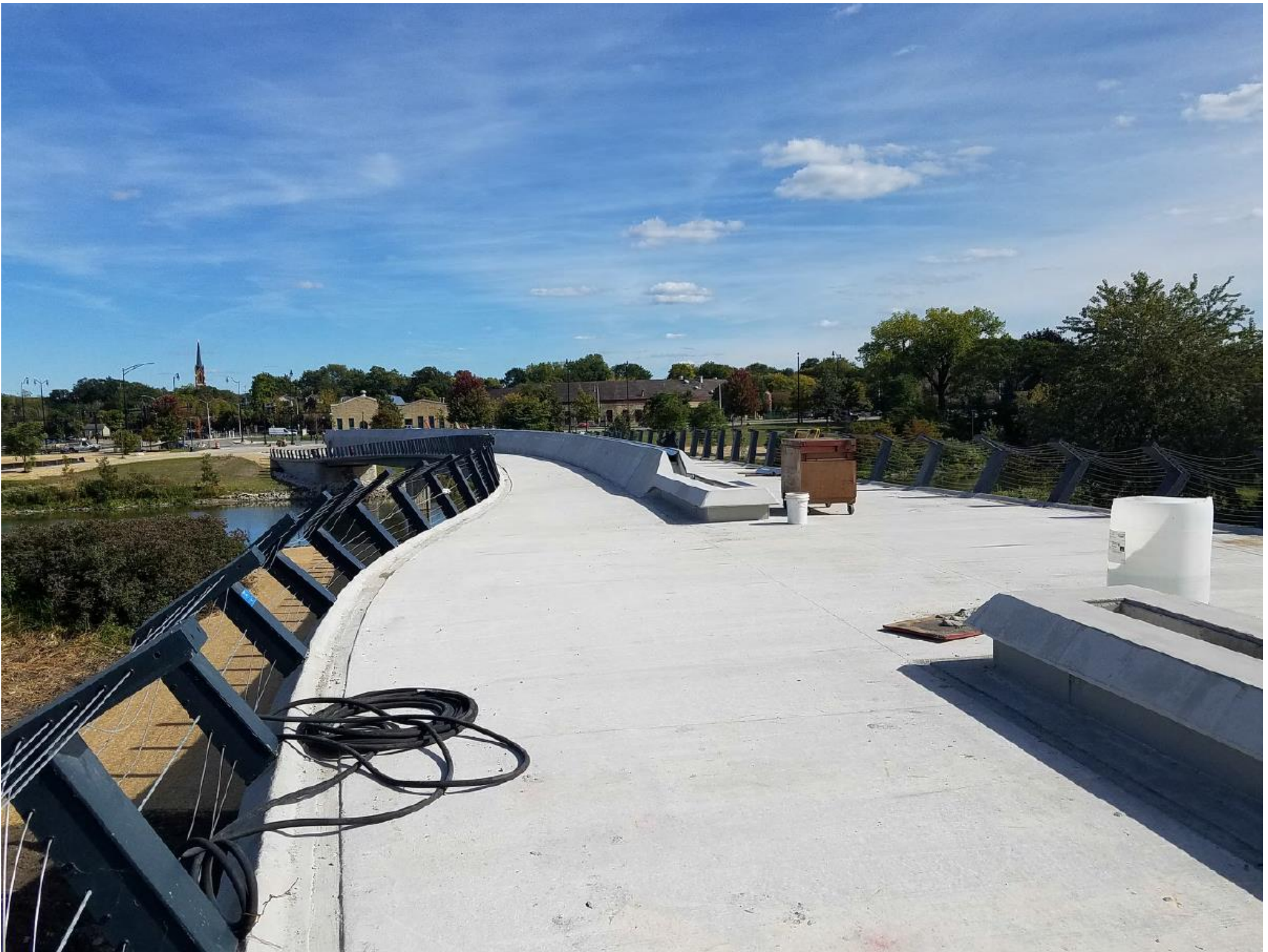
Current Condition- Looking east 10/2/2020