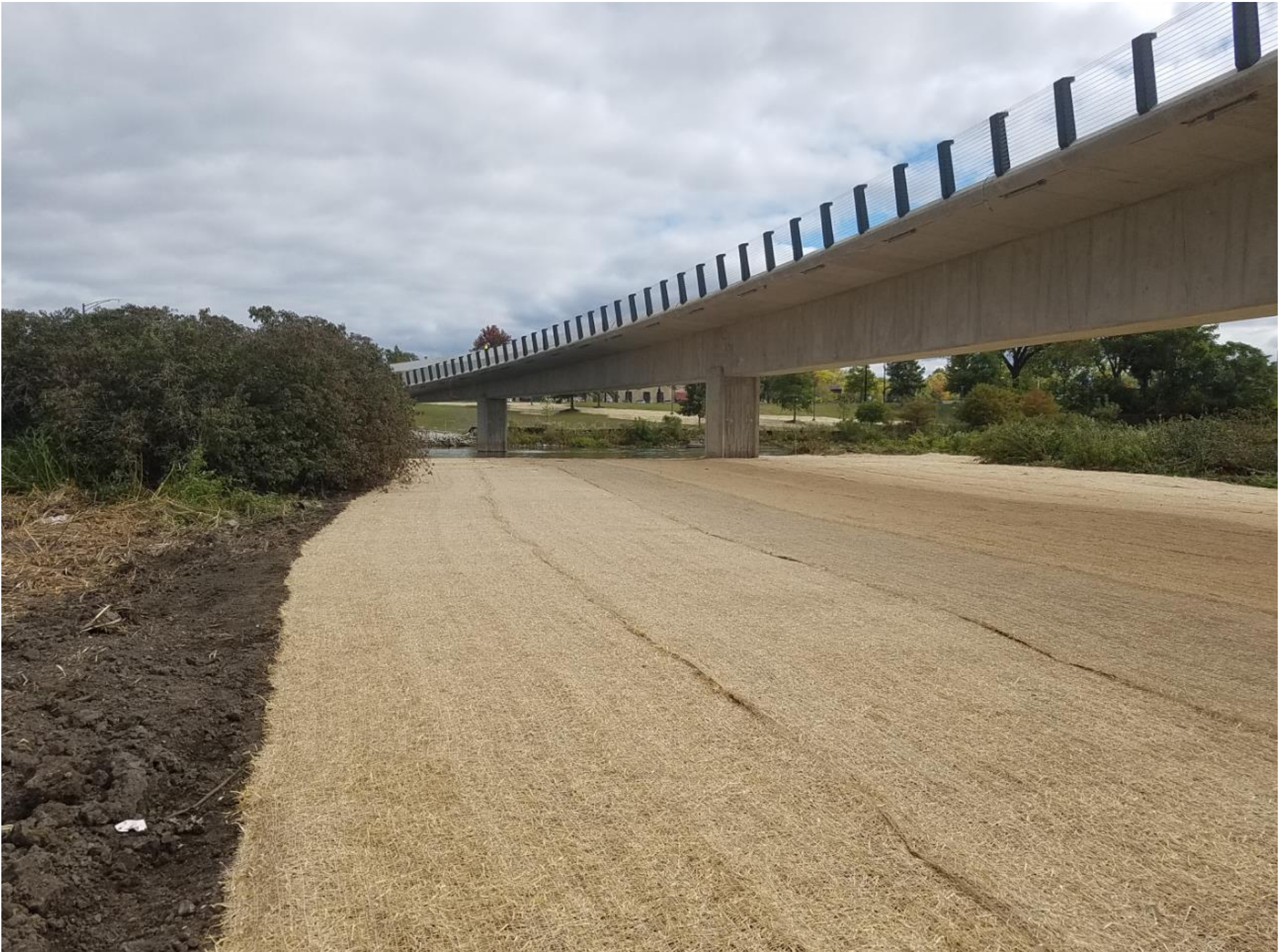
Seeding of Blues Island. Looking East. 10/1/2020