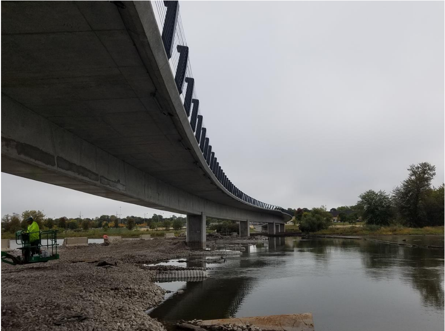
Grinding and Patching Lower Box 09/29/2020