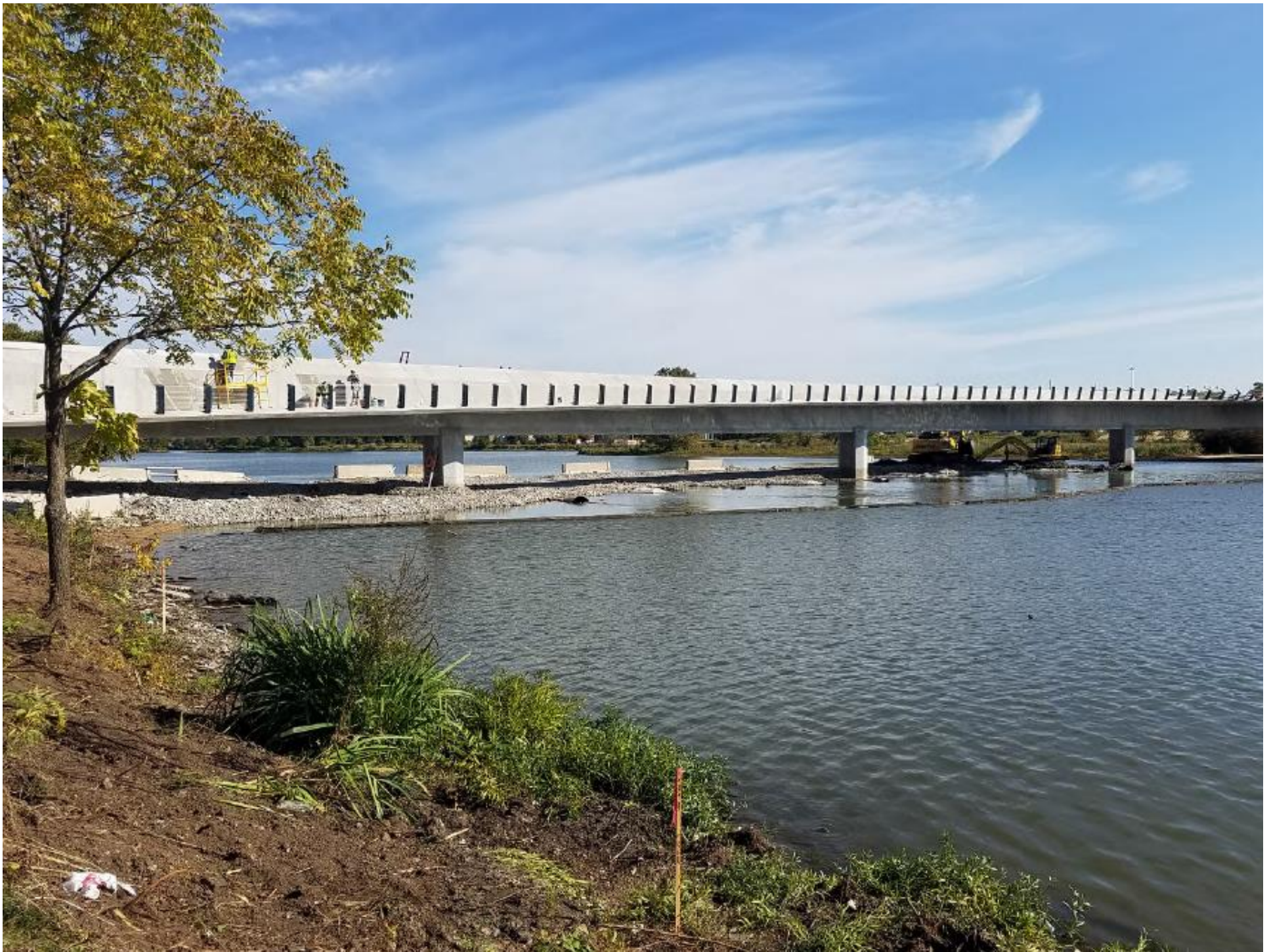
Removal of Causeway and patching upper box. Looking north. 10/06/2020