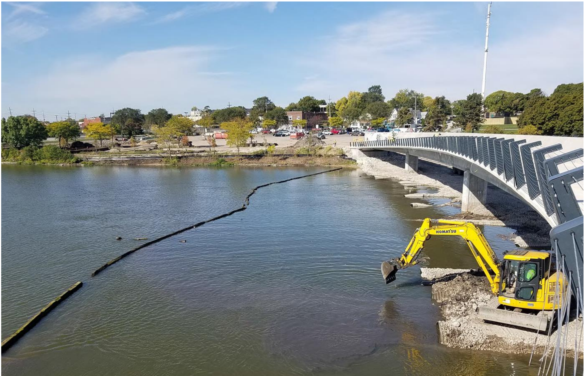
Removal of Causeway. Looking west 10/06/2020