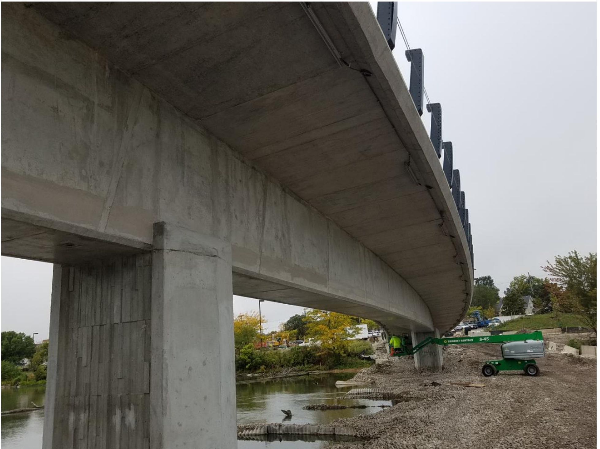
Grinding and Patching Lower Box 09/29/2020