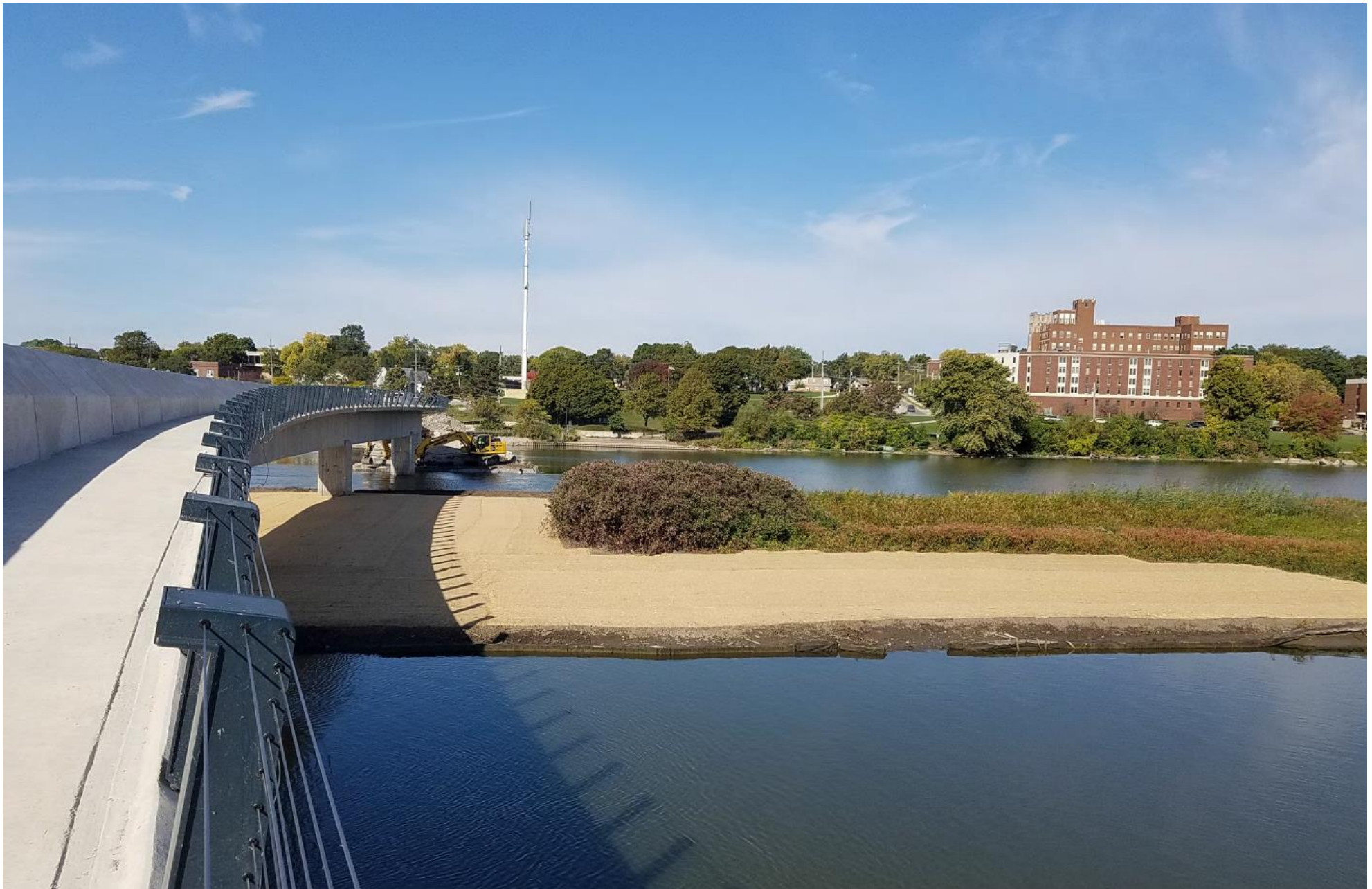
Removal of Causeway. Looking north. 10/08/2020