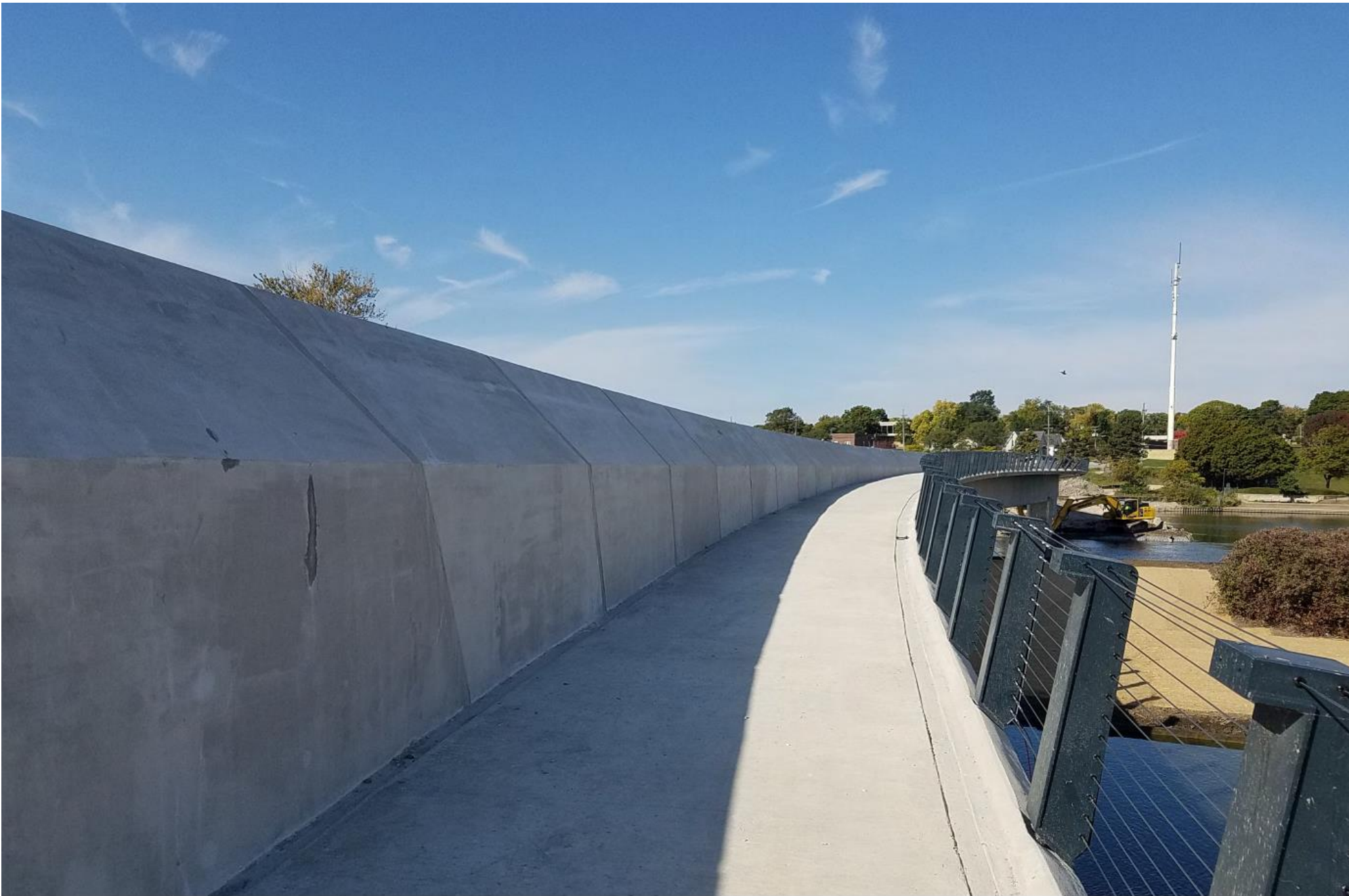
Upper Box, Looking west. 10/08/2020