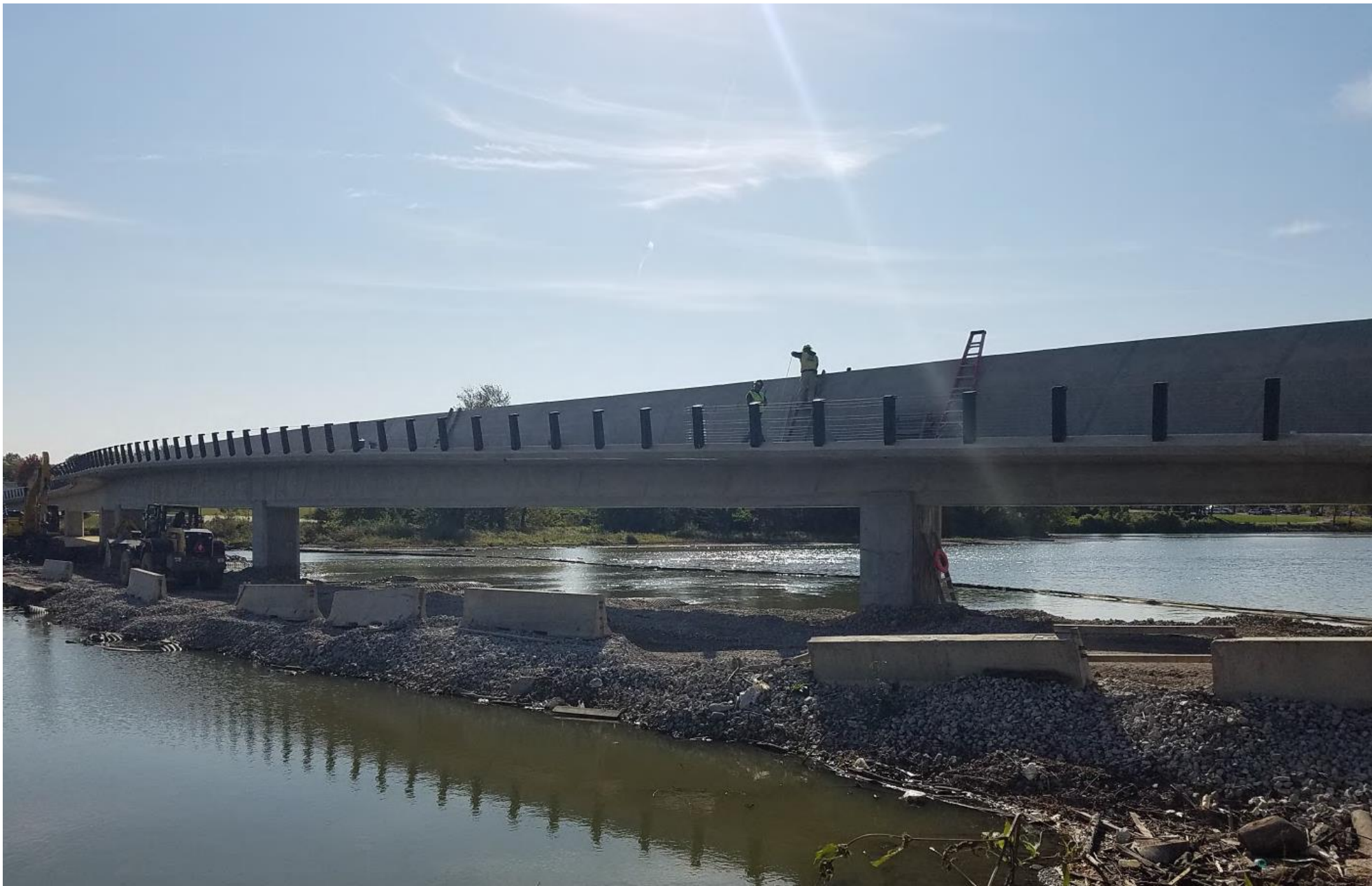
Removal of Causeway and installation of cornice lens. Looking SE. 10/06/2020