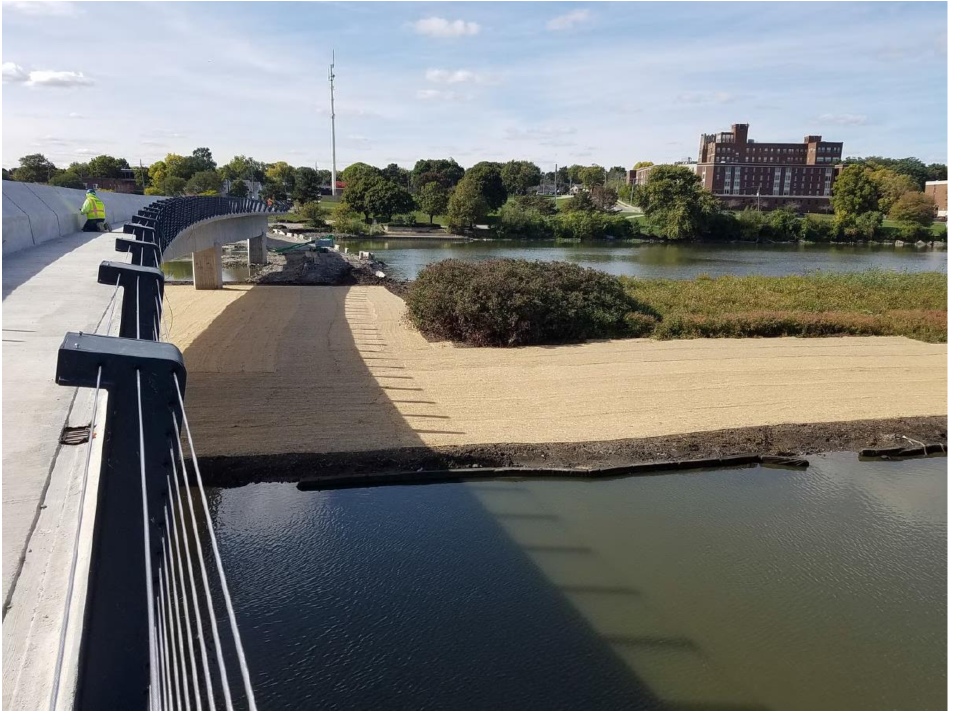
Patching of upper box - 10/02/2020. Looking west