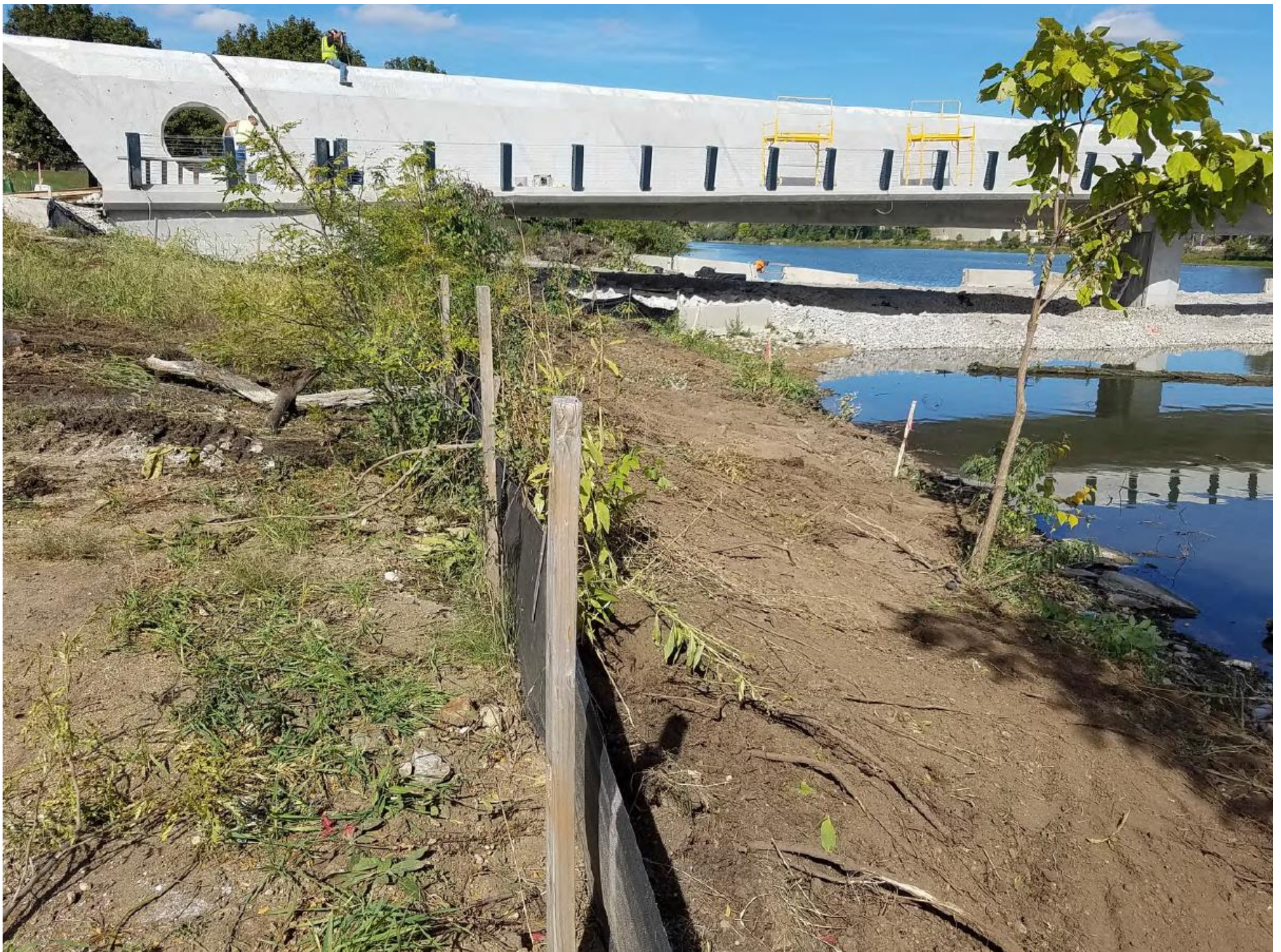
Re-grading of east river bank- 10/02/2020. Looking north