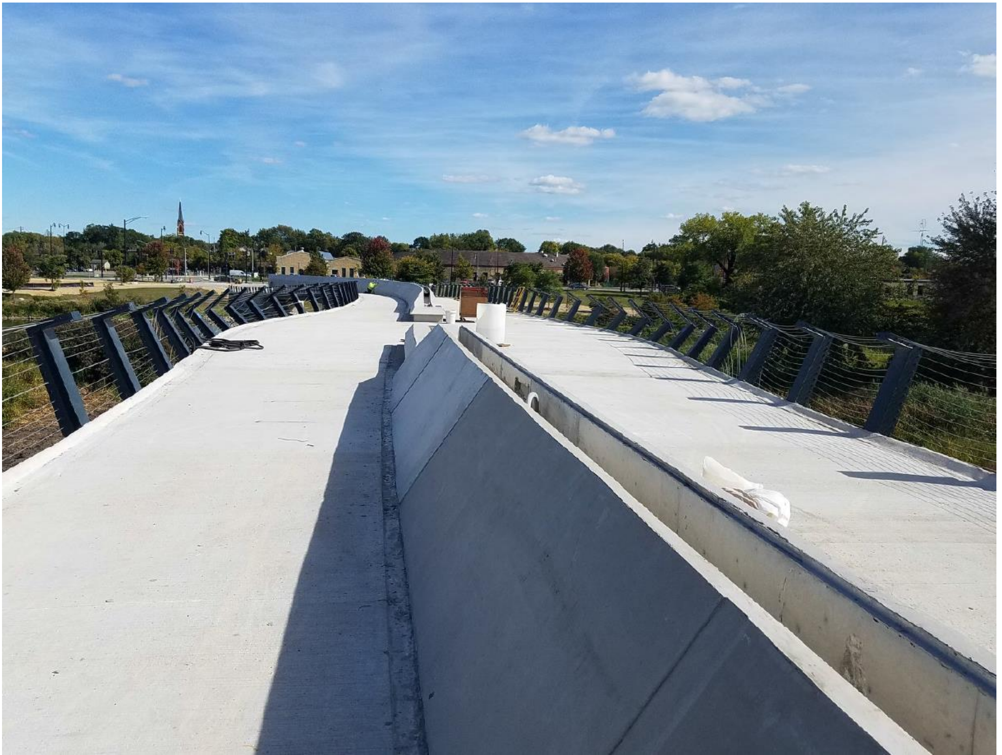
Patching of upper box - 10/02/2020. Looking west