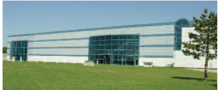
Aurora Water Treatment Facility

The City of Aurora maintains emergency back-up wells. These wells are sampled and tested monthly. This data is not included in this report, but is available upon request by contacting the Water Production Division at (630) 256-3250.